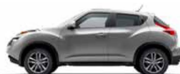
SL: ADDS MORE TO YOUR RIDE.