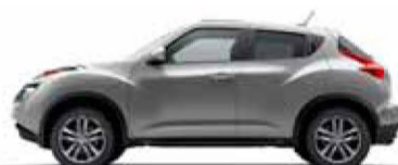
SV: GETS YOUR ADRENALINE PUMPING.