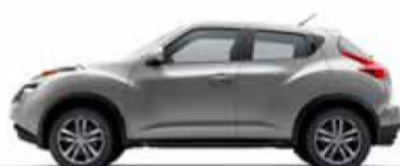
S: YOUR ALLY ON THE CITY STREETS.