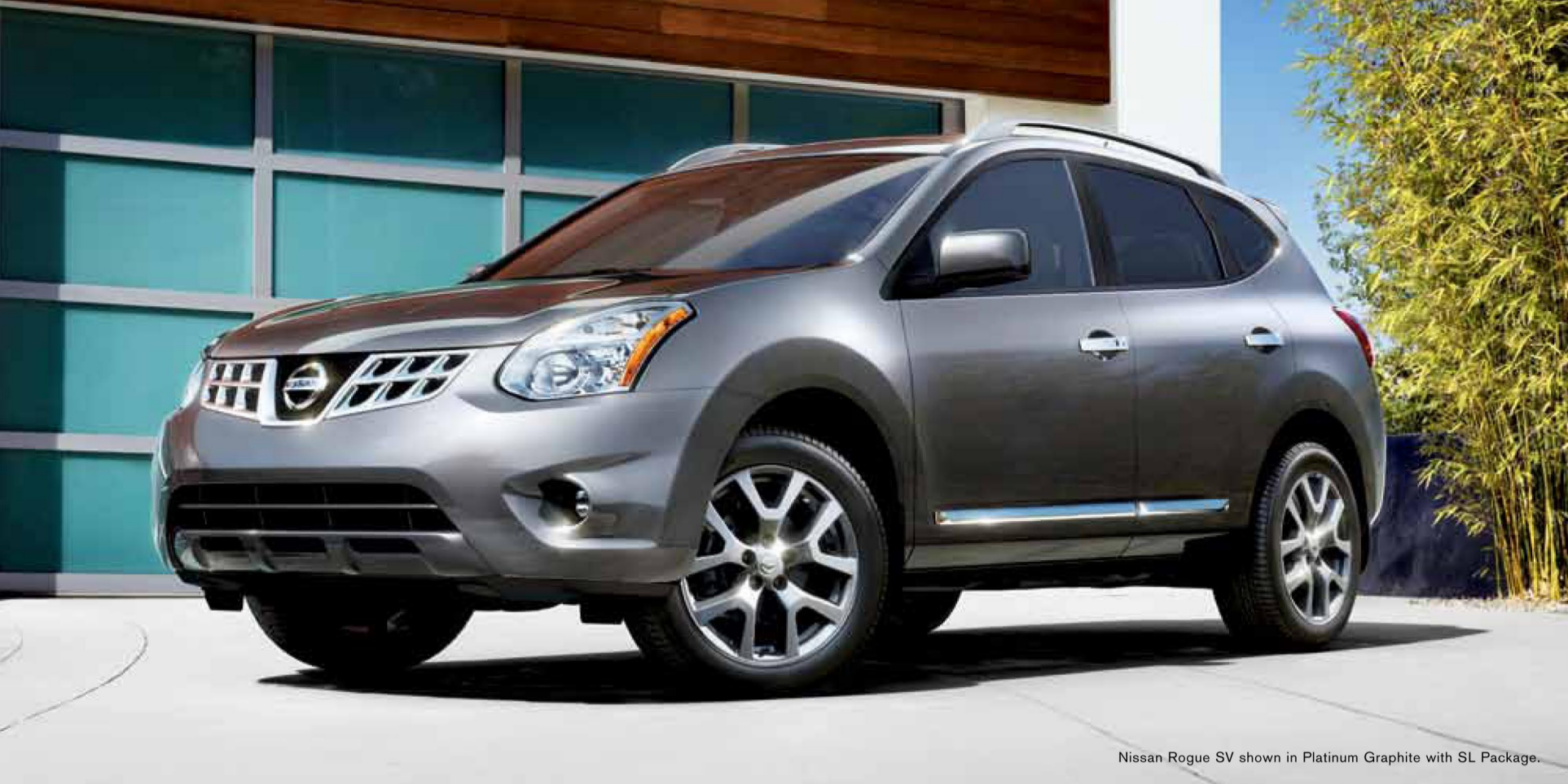
Nissan Rogue SV shown in Platinum Graphite with SL Package.