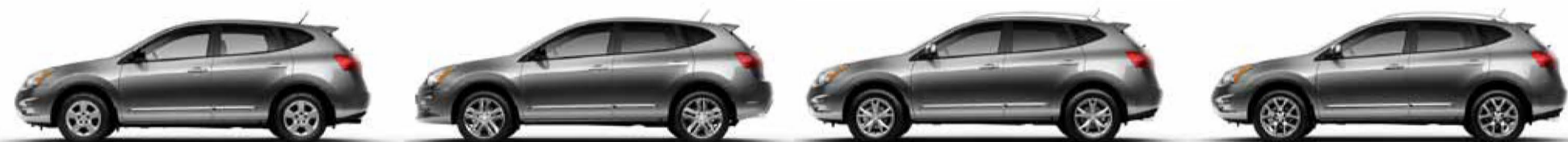
S: THE ORIGINAL CROSSOVER