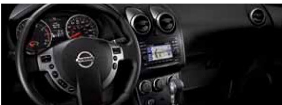
▲ Sporty gauges reflect its performance-oriented personality.

For more warranty information or questions on 2003-2011 vehicles equipped with a Continuously Variable Transmission, please visit www.NissanAssist.com .