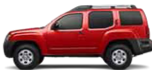
X: CORE EQUIPMENT