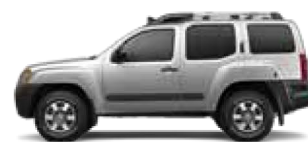
PRO-4X: WILD TO THE CORE