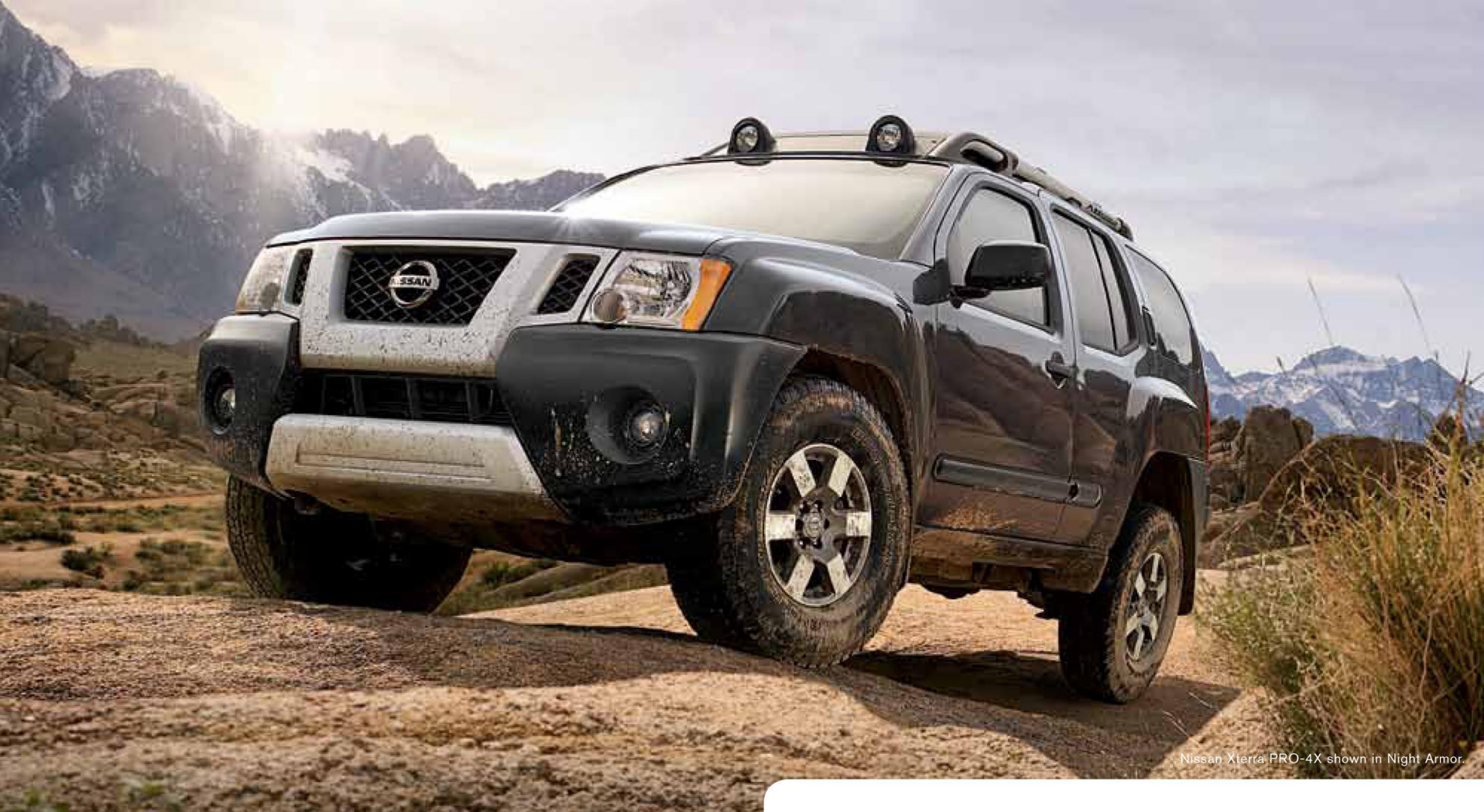
Nissan Xterra PRO-4X shown in Night Armor.