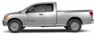
S KING CAB AND CREW CAB