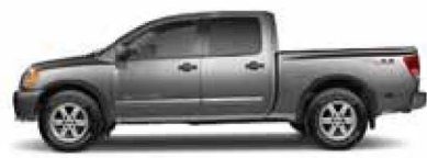
PRO-4X KING CAB AND CREW CAB