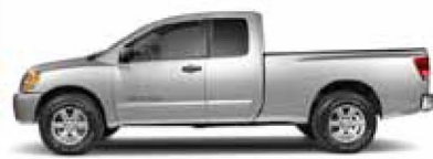
SV KING CAB AND CREW CAB