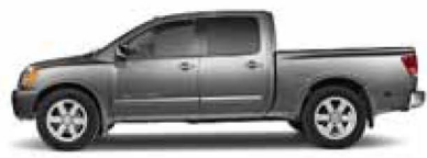
SL CREW CAB