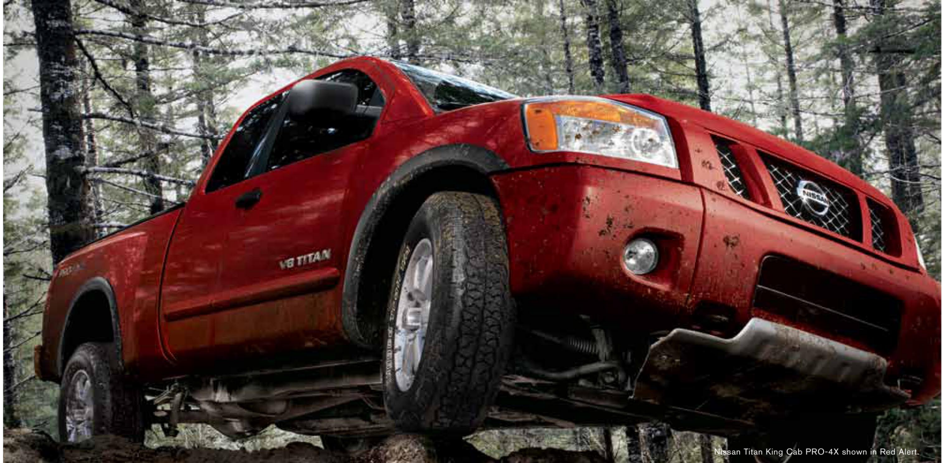
Nissan Titan King Cab PRO-4X shown in Red Alert.