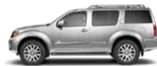
LE V6 AND LE V8: PREMIUM-EQUIPPED