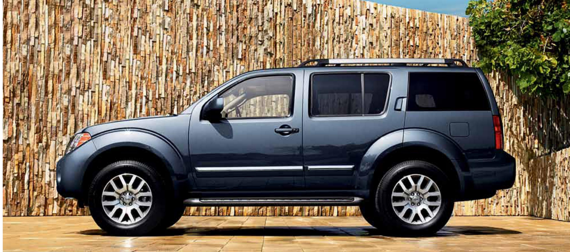
Pathfinder LE shown in Dark Slate.