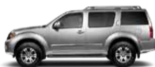
SILVER EDITION: CELEBRATING 25 YEARS