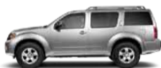
S: READY FOR ADVENTURE