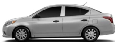
1.6 S: "STARTING AT" WAS NEVER BETTER EQUIPPED