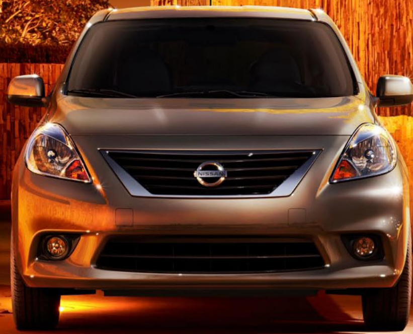
Nissan Versa Sedan 1.6 SL shown in Titanium.