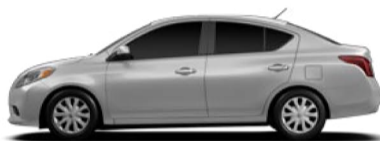
1.6 SV: A WHOLE NEW LEVEL OF COMFORT AND CONVENIENCE