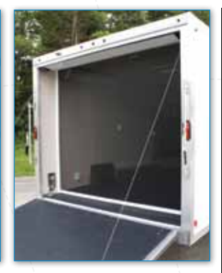
Rear Roll-Down Screen