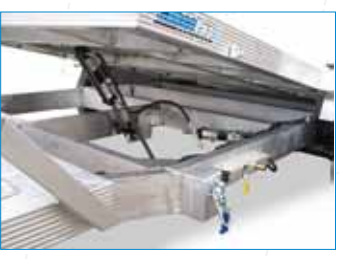
Hydraulic Tilt System w/ Control Valve