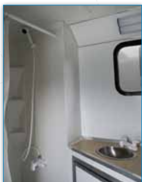
Deluxe Bathroom Package