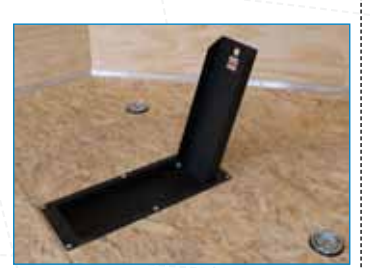
Flip-Up Motorcycle Wheel Chock