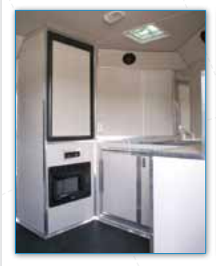
Refrigerator, Microwave, Sink

Gearing up for a day at the track or a weekend camping excursion? CargoPro toy haulers series is designed with versatility in mind. Coming standard with a fold-down sofa and dinette, hot and cold running water, a 2-burner propane stove and our basic 110V package, you'll have everything you need with you...including the kitchen sink.