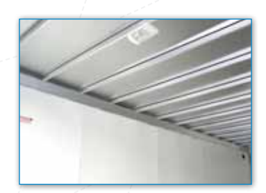
Optional White Luan Interior Walls w/ Trim

1 Year Limited Warranty (5/6-Wide Lites) 4 Year Limited Warranty (7/8-Wide Lites)