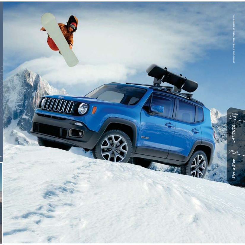
Shown with aftermarket roof rack accessories.