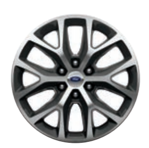
20" Bright-Machined Aluminum with Magnetic-Painted Windows Available