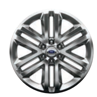
22" Polished Aluminum Optional