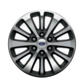
18" Bright-Machined Aluminum with Magnetic-Painted Pockets Standard