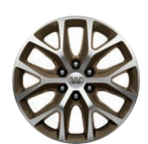
20" Bright-Machined Aluminum with Caribou-Painted Pockets and King Ranch Center Caps Standard

King Ranch logo embroidered on floor mats.