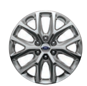
20" Polished Aluminum Standard