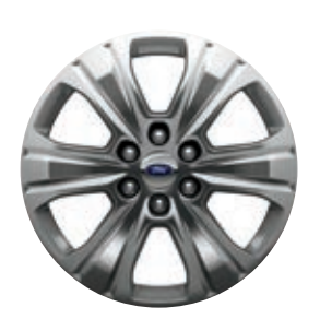
20" Polished Aluminum Standard

Chrome liftgate appliqué with satin-aluminum finish accent bar.