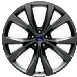
21" Premium Tarnished Dark-Painted Aluminum Available