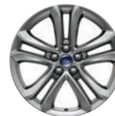
18" Polished Aluminum Available (requires snow chain-compatible tires)