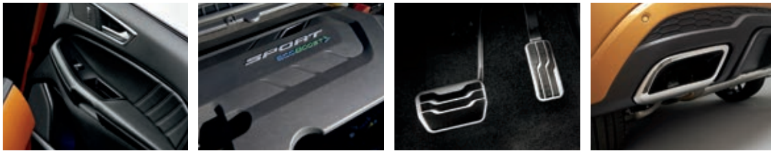
Electric Spice. Available equipment.