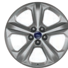
18" Sparkle Silver-Painted Aluminum Standard: SE

Utility Package includes hands-free foot-activated liftgate, perimeter alarm, and universal garage door opener (requires 201A)