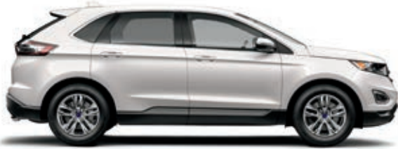
White Platinum Metallic Tri-coat