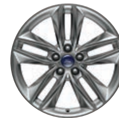
18" Sparkle Silver-Painted Split-Spoke Aluminum Standard: SEL