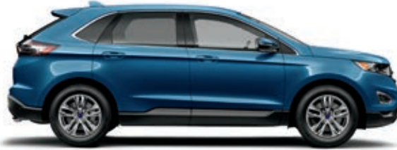
Too Good to Be Blue*