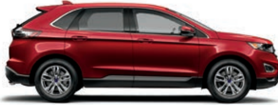
Ruby Red Metallic Tinted Clearcoat