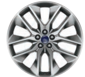
20" Polished Aluminum with Dark Stainless-Painted Pockets Available