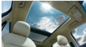
SEL. Magnetic. Available equipment.