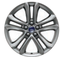
18" Polished Aluminum Available: SEL