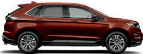
Bronze Fire Metallic Tinted Clearcoat