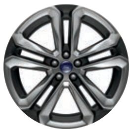
20" Polished Aluminum with Low-Gloss Magnetic-Painted Pockets Standard