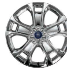
18" Chrome Alloy Finish Available: SE