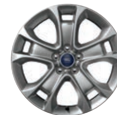
18" Sparkle Nickel-Painted Aluminum Standard

High-intensity discharge (HID) headlamps!*