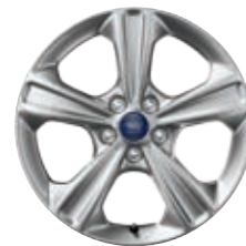
17" Sparkle Silver-Painted Aluminum Optional: S; Standard: SE