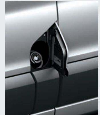
Easy Fuel® capless fuel filler.

1 Row availability varies by seating configuration.