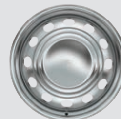
16" Silver Steel with Silver Front Hubcap (front wheel shown) Standard: DRW Passenger Wagon & Van