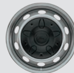
16" Silver Steel with Black Hubcap Standard: XL Passenger Wagon, SRW Van, and Cutaway & Chassis Cab