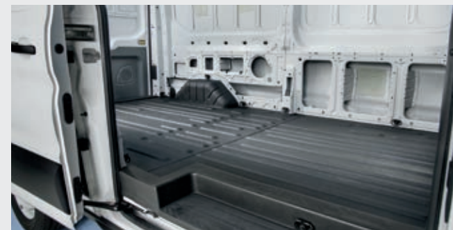
Rear view camera display 1 (top). Tough Bed® spray-in cargo floor liner 1 (bottom).