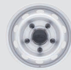
16" White Steel with Mini-Cap and Lug Nut Covers Optional: All SRW (Fleet only)