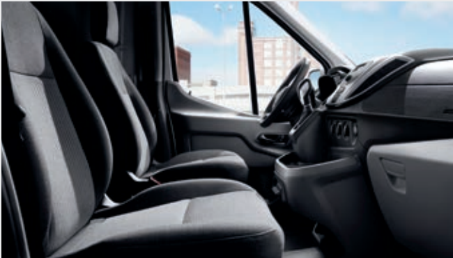
Cloth-trimmed 2 interior in Pewter with user-defined upfitter switches 2 and available equipment.