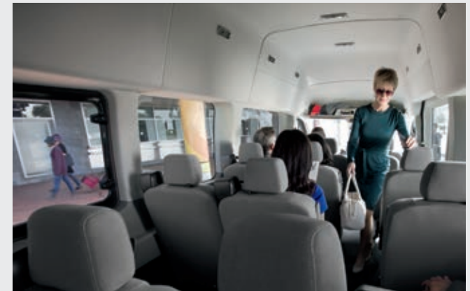
15-passenger XLT HR LWB EL cloth-trimmed interior in Pewter with available equipment.