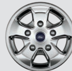
16" Easy-To-Clean Aluminum with Locking Lug Nuts Optional: All SRW (n/a with 9,500 lbs. GVWR or greater)