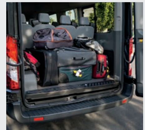
15-passenger XLT HR LWB EL cloth-trimmed interior in Pewter with class-best factory-built cargo capacity and available equipment.