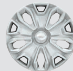
16" Black Steel with Silver-Styled Cover Standard: SRW XLT Passenger Wagon Optional: XL Passenger Wagon, SRW Van, and Cutaway & Chassis Cab