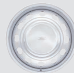
16" White Steel with White Front Hubcap (front wheel shown) Standard: DRW Cutaway & Chassis Cab Optional: DRW Passenger Wagon & Van (Fleet only)