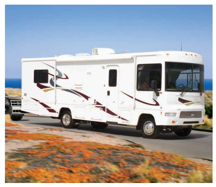
Note: Some aftermarket camper centers offer kits which may allow vehicles with automatic transmissions to be flat-towed. See page 26 for kits from Ford Custom Accessories.

Metric Conversion – To obtain information in kilograms, multiply pounds by .45; to obtain information in kilometers, multiply miles by 1.6; to obtain information in centimeters, multiply feet by 30.48.