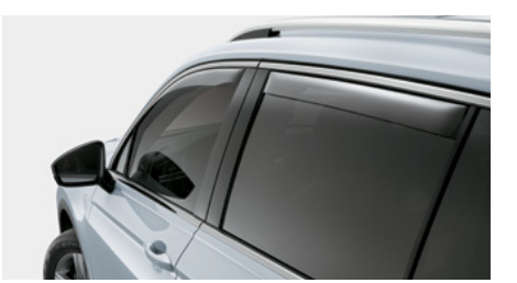
Side Window Deflector Kit – Tinted