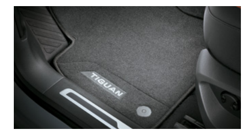
MojoMats<sup>®</sup> with Tiguan Logo

*6 years/72,000 miles (whichever occurs first) New Vehicle Limited Warranty on MY2018 and newer WW vehicles, excluding e-Golf. See owner's literature or dealer for warranty exclusions and limitations. **Claim based on manufacturers' published data on length and transferability of car and SUV Bumper-to-Bumper/Basic warranty only. Not based on other separate warranties. Tenuine Volkswagen Accessories installed by an authorized Volkswagen dealer are covered for the greater of: (1) the accessory limited warranty period (12 months or 12,000 miles, whichever occurs first) from the time of purchase; or (2) the remainder of the New Vehicle Limited Warranty period Non-genuine Volkswagen Accessories may be covered under separate manufacturer warranties, may be no be found at WAccessoriesWarranty.com. Visit VWAccessoriesWarranty.com vise expartigiting Volkswagen dealer for complete details. *IProper installation may be recommended. See owner's literature and dealer for details. *All roof rack attachments sold separately. Recreational equipment not included. **Check local regulations concerning the use of side window deflectors. *See vehicle Owner's Manual for further details and important warnings about the keyless ignition feature. Do not leave vehicle unattended with the engine running, particularly in enclosed spaces.