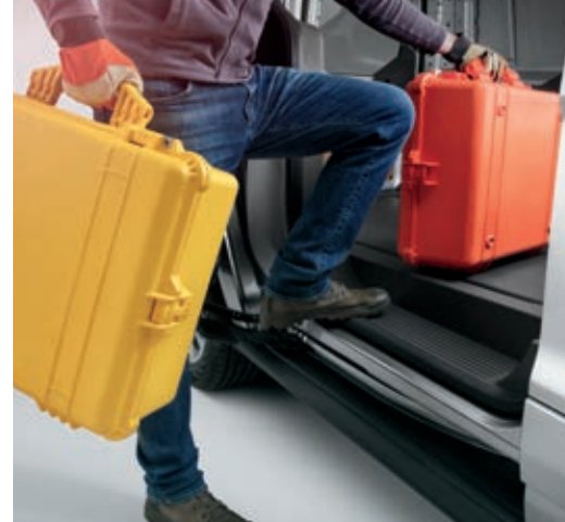
LOW STEP-IN HEIGHT: UNDER 2'