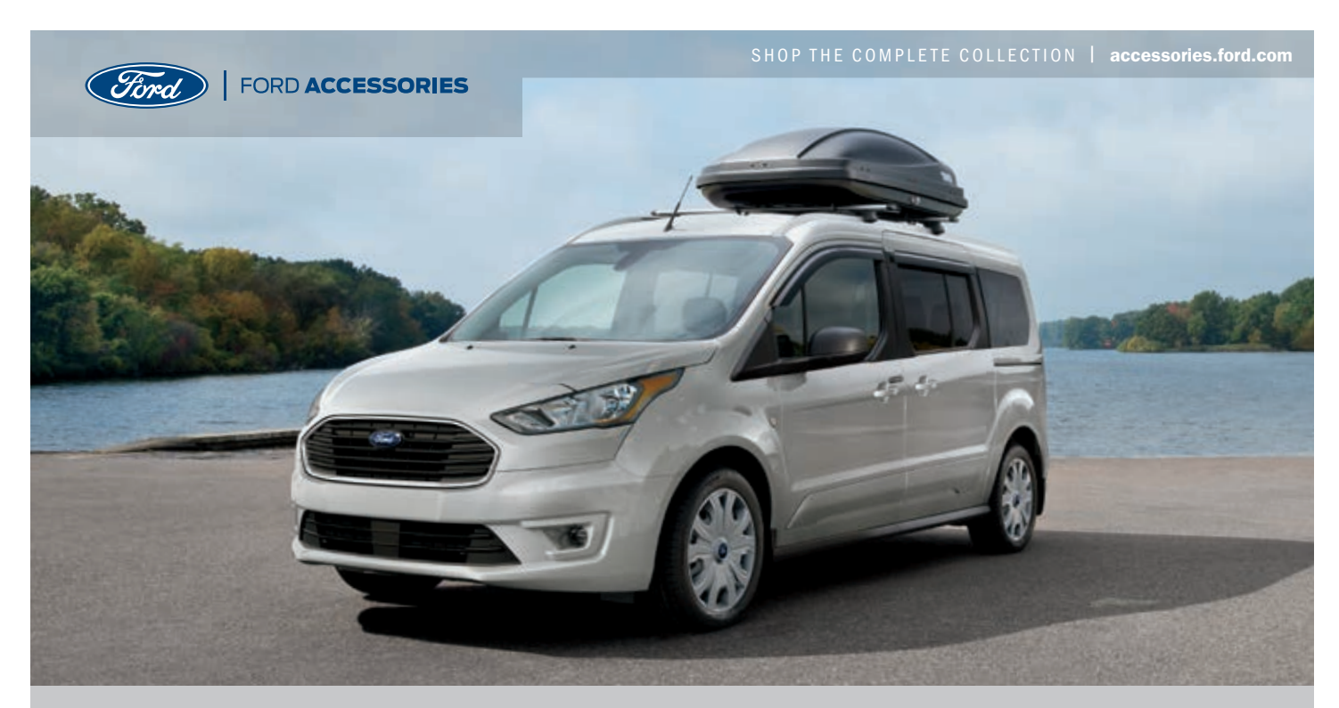
Passenger Wagon XLT LWB in Silver accessorized with keyless entry keypad, side window deflectors, molded splash guards, and roof crossbars and cargo box<sup>1,2</sup>