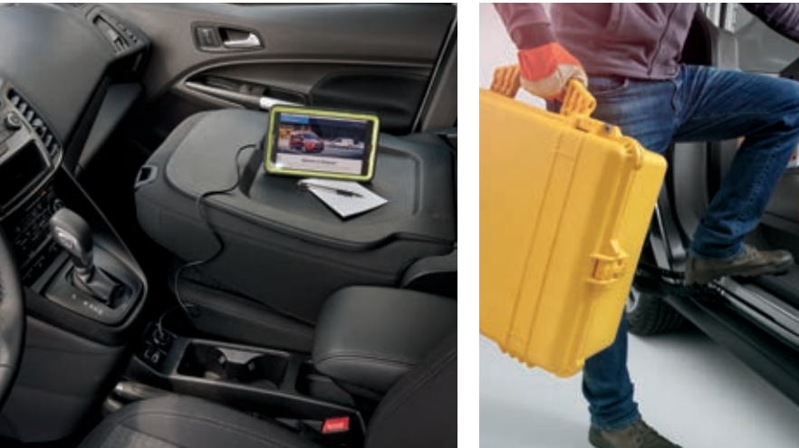
FOLD-FLAT PASSENGER SEAT BACK

Whichever wheelbase you choose (SWB or LWB), Transit Connect Cargo Vans offer plenty of versatility all around. Every Cargo Van features a flat rear load floor, convenient cargo tie-down hooks, near-vertical walls, and vinyl floor covering that's DURABLE AND WASHABLE . Inside LWB models, you can fold the passenger seat down for up to 145.8 cu. ft. of cargo space. You can also fit items UP TO 4' WIDE, 4' TALL, OR OVER 9' LONG in LWB models.<sup>2</sup> With SWB models, you can enjoy a nimble 38.3' curb-to-curb turning diameter. Take your business everywhere you've dreamed in Transit Connect.