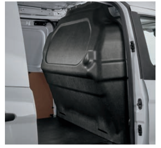
AVAILABLE COMPOSITE BULKHEAD PARTITIONS