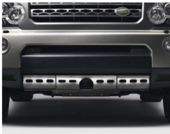
Underbody Protection For 2010 vehicles onward without a winch — VPLAP0024