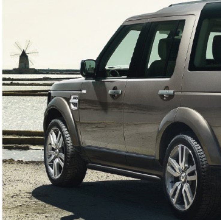
Side Protection Tubes (Black Steel) For 2010 vehicles onward — VTD500010