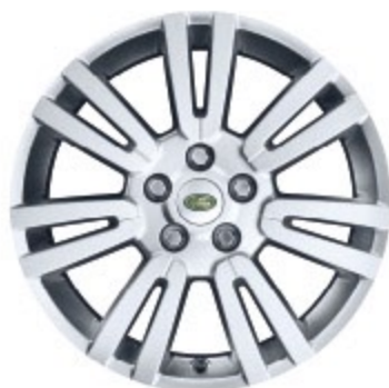
19-inch 7-Split Spoke Alloy Wheel (Rim only) Sparkle Silver Finish — LR013925 For 2009 vehicles onward