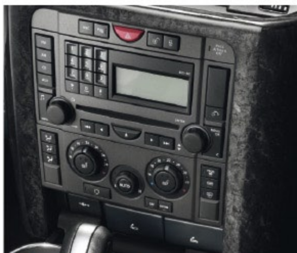
Grey Birdseye Maple Fascia Kit For pre-2008 SE and HSE models — VUB504360