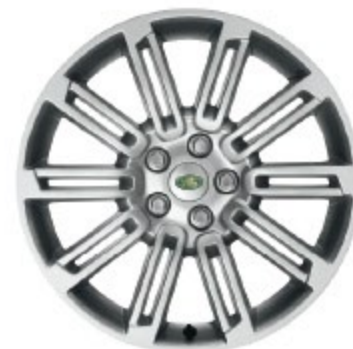
20-inch 8.5J 10-Spoke Alloy Wheel (Rim only) Titan Silver Finish — VPLAW0003* For 2009 vehicles onward

Center Cap Bright Polished Finish — RRJ500060MUZ