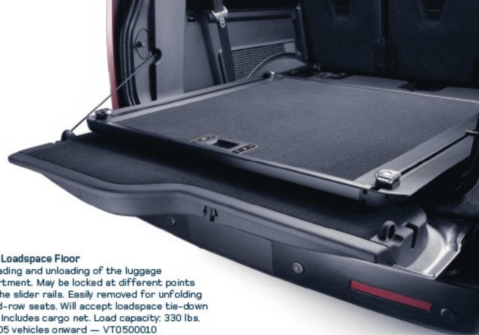
Sliding Loadspace Floor Aids loading and unloading of the luggage compartment. May be locked at different points along the slider rails. Easily removed for unfolding of third-row seats. Will accept loadspace tie-down points. Includes cargo net. Load capacity: 330 lbs. For 2005 vehicles onward — VT0500010