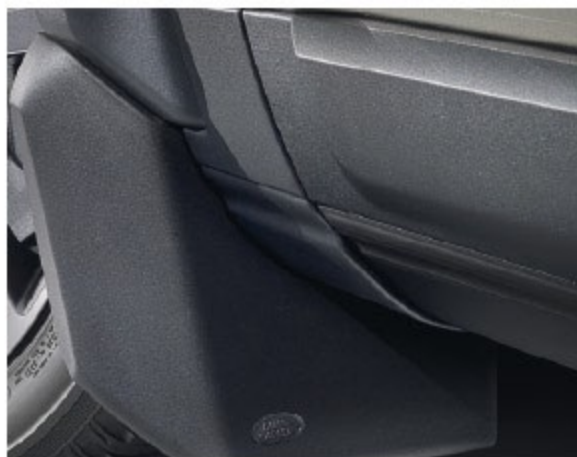
Front Mudflaps For 2010 vehicles onward — CAS500010PCL