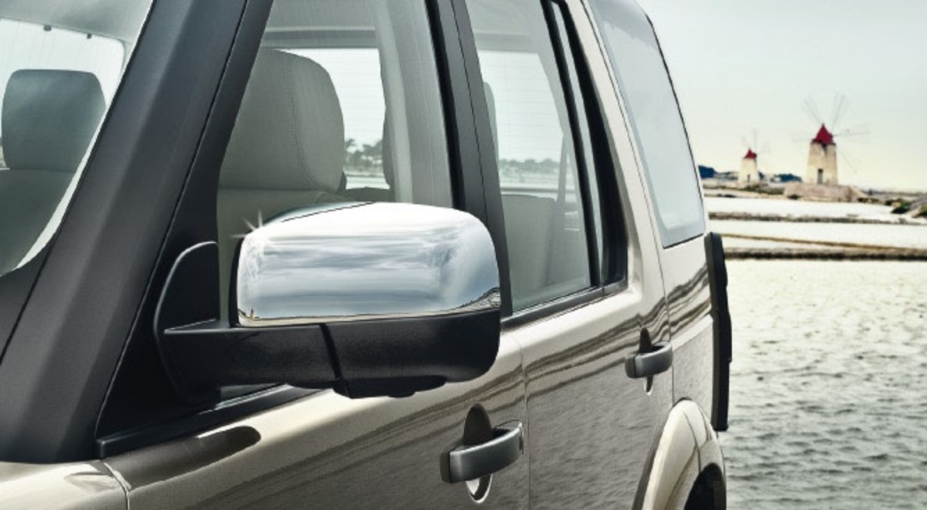
Bright Finish Mirror Kit For 2010 vehicles onward (Upper) — VPLMB0041