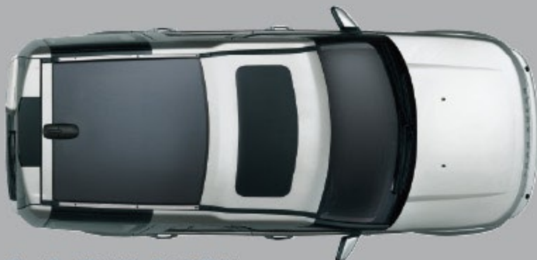
Short Roof Rail Kit – Bright Finish Designed for vehicles not fitted with factory-fit roof rails. CAP500090