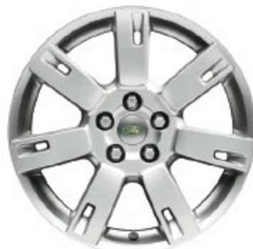
19-inch 7-Spoke Alloy Wheel (Rim only) Sparkle Silver Finish — LR008547 For 2009 vehicles onward

Center Cap Sparkle Silver Finish — RRJ500030MNM