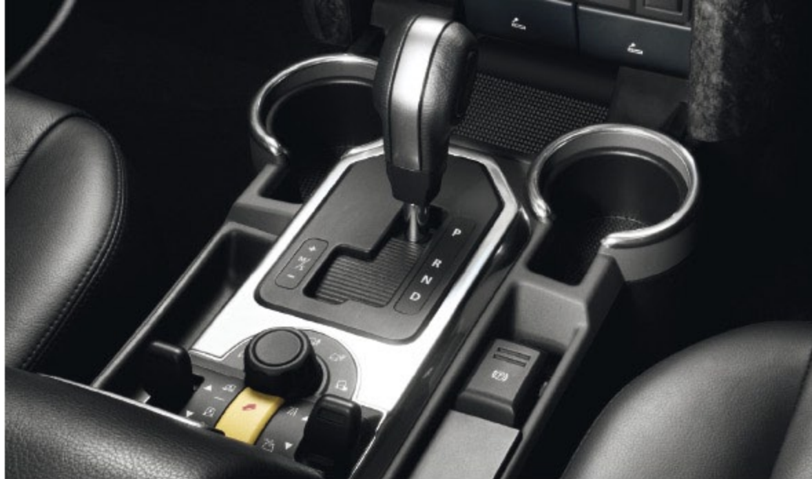
Bright Finish Gear Change and Cup Holder Surrounds For 2005-09 vehicles only — VUB501166

Your Land Rover's intuitive, sumptuous interior exudes craftsmanship and comfort. There is also the opportunity to add even more practicality with accessories such as a cargo barrier, stainless steel sill tread plates and waterproof seat covers.