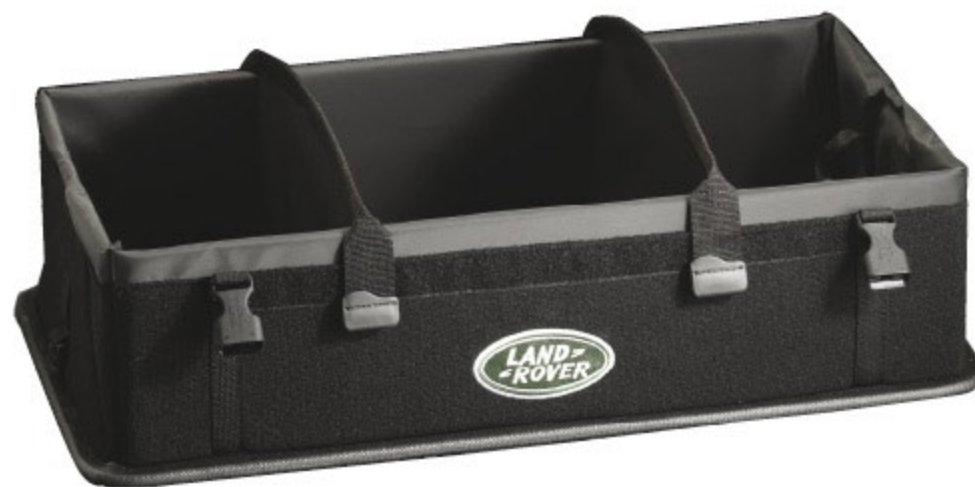
Collapsible Cargo Carrier Store items during transport with this handy Collapsible Cargo Carrier. Includes separators for added convenience. EEA500050PVJ