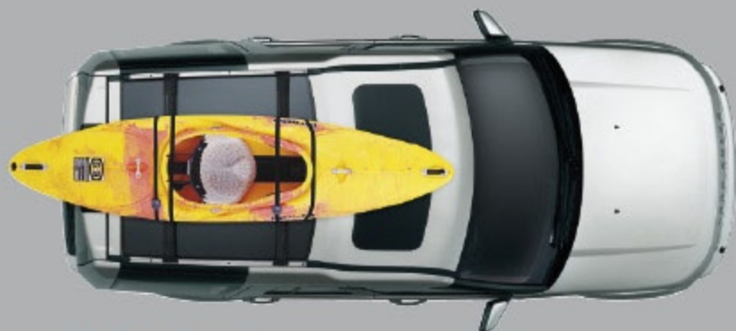
Aqua Sports Carrier* Carries one surfboard or sailboard and mast, or one canoe or kayak. Load capacity: 99 lbs. LR006846

*Roof Rails and Crossbars are required for all Land Rover roof-mounted accessories. Objects placed above the roof-mounted satellite antenna may reduce the quality of the signal received by the vehicle and could have a detrimental effect on the navigation and satellite radio systems, if fitted.