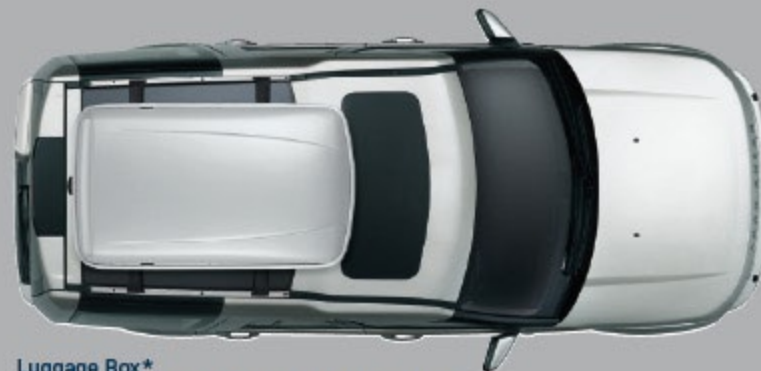
Luggage Box* Lockable for security. Opens from both sides. External dimensions: 63" long x 37½" wide x 16" high. Volume: 118 gallons. Load capacity: 120 lbs. LR005334