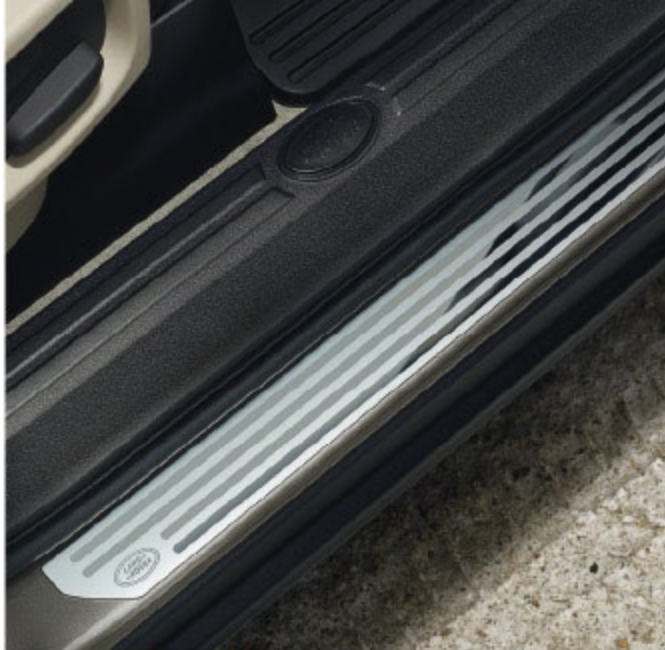
Stainless Steel Sill Tread Plate Covers front and rear door sills. EBN500041