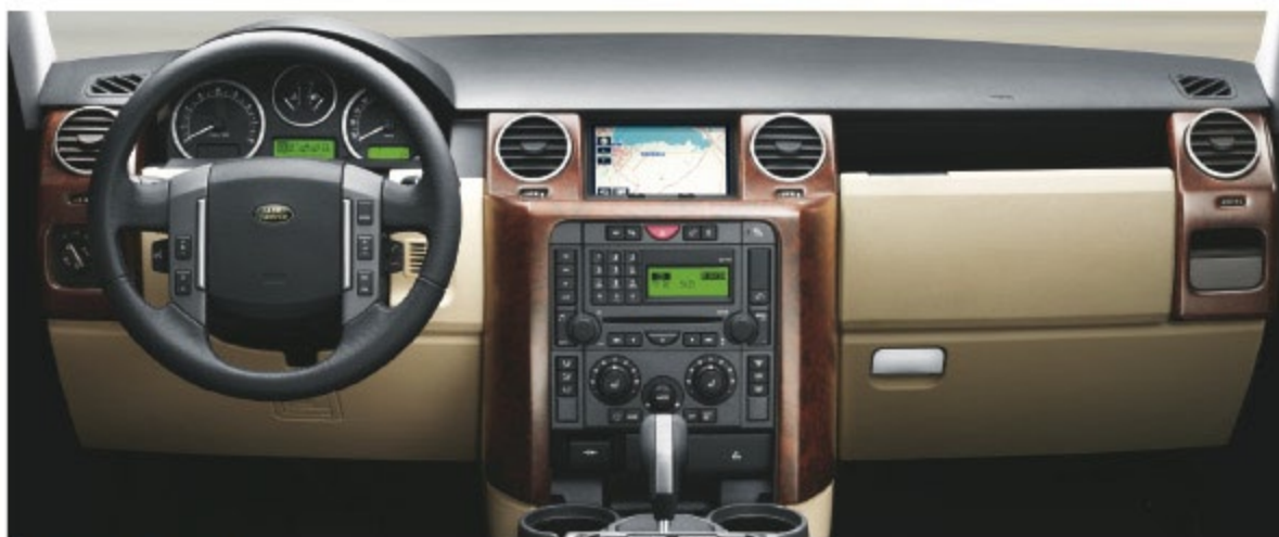
Burr Walnut Fascia Kit Comprises center console panel and air vent surrounds. For pre-2008 SE and HSE models — VUB504370