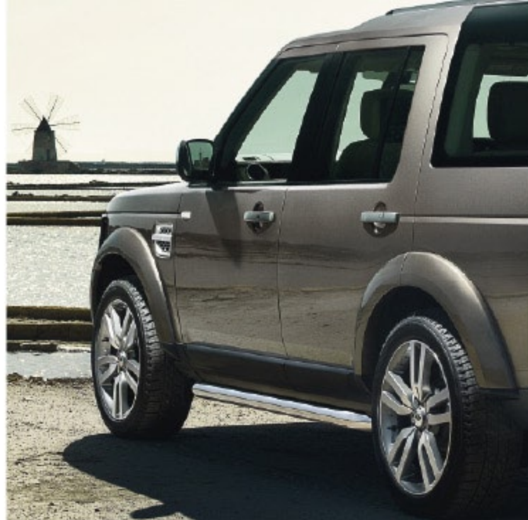
Side Protection Tubes (Stainless Steel) For 2010 vehicles onward — VTD500020