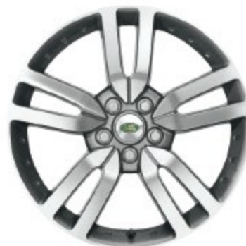
20-inch 8.5J 5-Spoke Alloy Wheel (Rim only) Diamond Turned Finish — VPLAW0002* For 2009 vehicles onward

Center Cap Sparkle Silver Finish — RRJ500030MNH