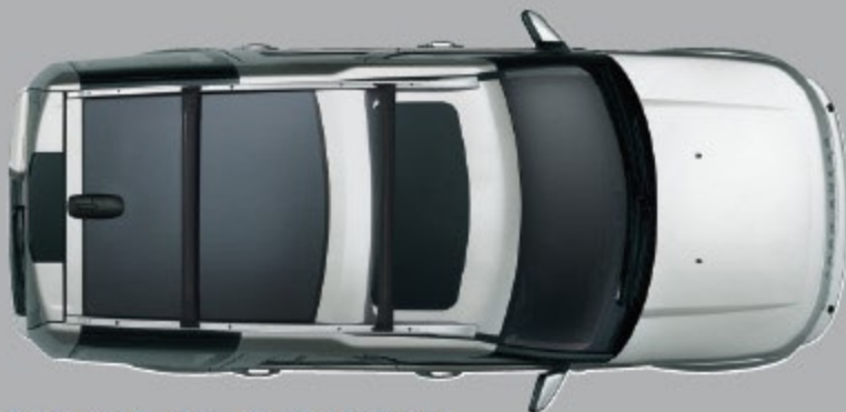
Full Length Roof Rail Kit – Bright Finish Cross bars sold separately. See page 16. LR006442