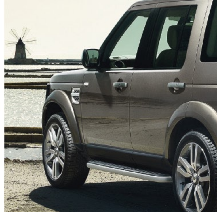
Fixed Side Steps For 2010 vehicles onward — VPLAP0035