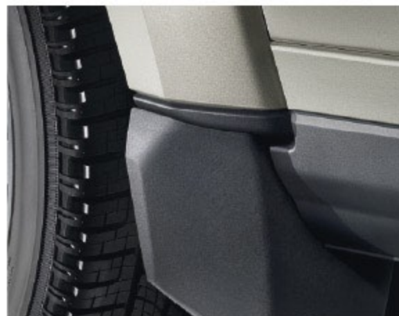
Rear Mudflaps For 2009 vehicles onward — VPLAP0017 For 2009 vehicles — VPLAP0002 For 2005-08 vehicles — CAT500010PCL