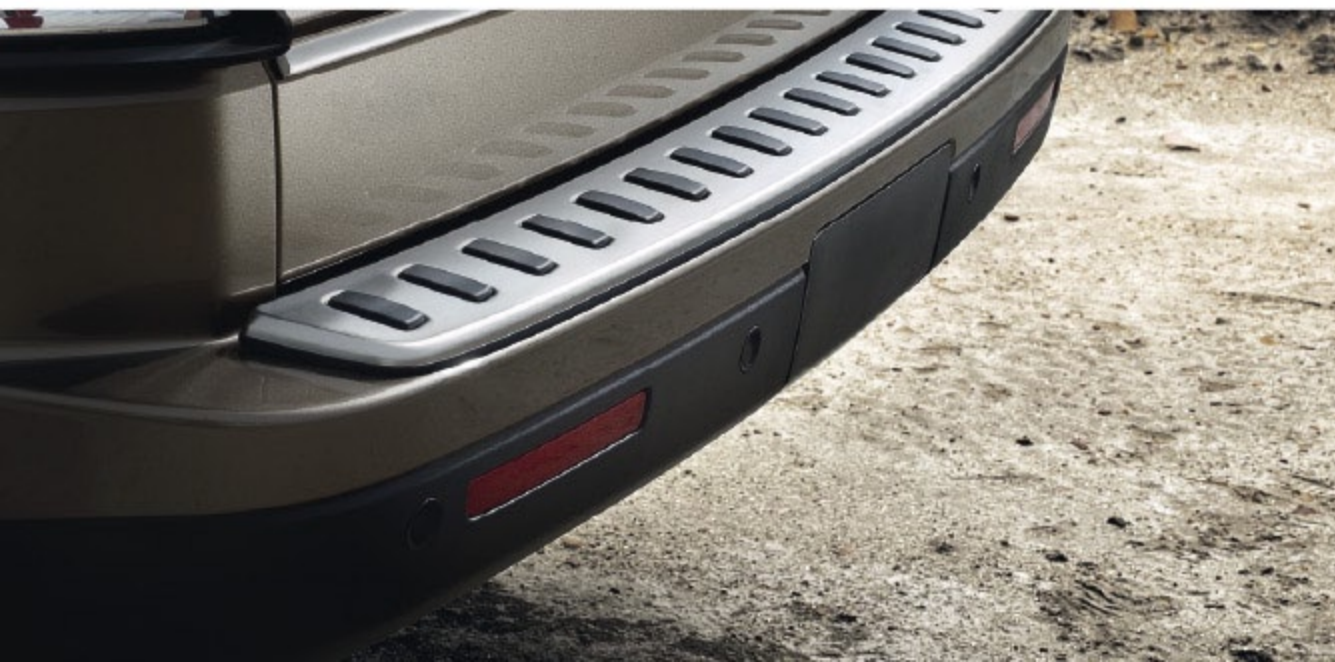
Stainless Steel Finisher Pack Includes the Stainless Steel Lower Door Trim Finisher (shown below) and the Stainless Steel Tailgate Trim Finisher (shown at left). For 2010 vehicles onward — VPLAB0044