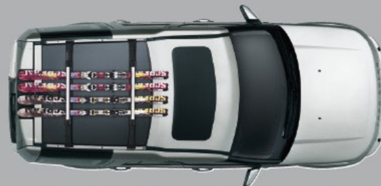
Ski and Snowboard Carrier* Lockable for security. Carries four pairs of skis or two snowboards. Incorporates slider rails for easy loading. Load capacity: 79 lbs. LR006849

*Roof Rails and Crossbars are required for all Land Rover roof-mounted accessories. Objects placed above the roof-mounted satellite antenna may reduce the quality of the signal received by the vehicle and could have a detrimental effect on the navigation and satellite radio systems, if fitted.