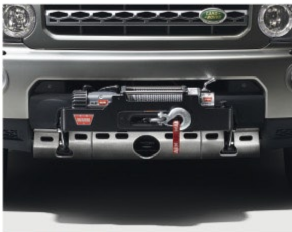
Underbody Protection For 2010 vehicles onward with a winch — VPLAP0025