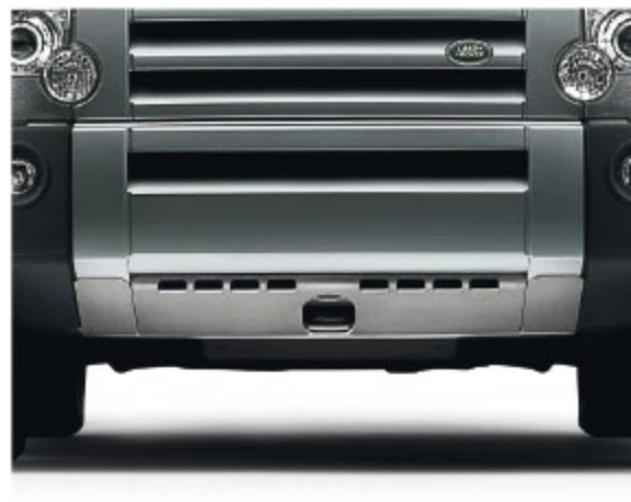
Underbody Protection For 2005-09 vehicles without a winch — LR007483 For 2005-09 vehicles with a winch (not shown) — KRQ500010