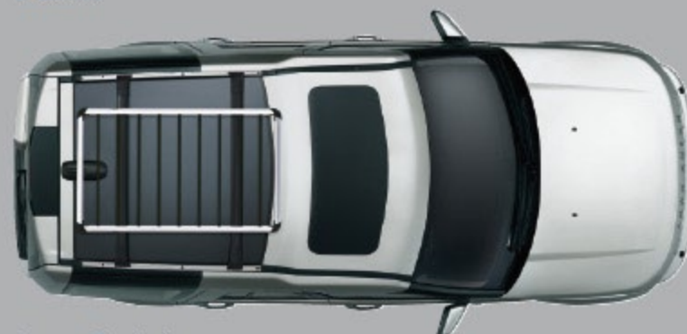
Luggage Carrier* Load capacity: 138 lbs. LR006848