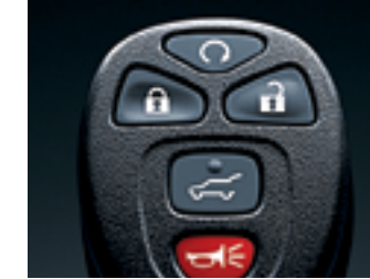
Available remote vehicle starter system.

60/40 FLEXIBLE SEATING You can get standard seating for eight (depending on model) with second- and third-row flat-folding 60/40 split-bench seats. Or you can choose available seating for seven (depending on model) with second-row flat-folding captain's chairs and a third-row flat-folding 60/40 split-bench seat.