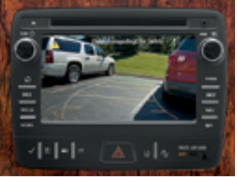
Rear vision camera.