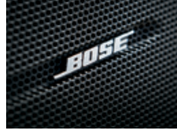
Available Bose premium audio system.

SIRIUSXM SATELLITE RADIO ™ Featuring 120 channels of commercial-free music, talk, comedy, news, family programming and more, SiriusXM 4 with a 3-month trial subscription offers something for everyone.