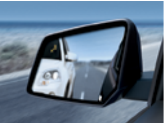
Available Side Blind Zone Alert 1