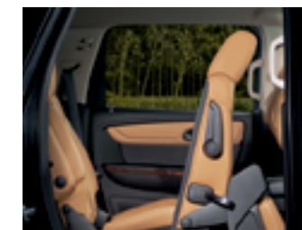
Convenient Smart Slide seat.

1 Cargo and load capacity limited by weight and distribution. 2 Based on WardsAuto.com 2013 Large Cross/Utility Vehicle segment and latest competitive information available at the time of printing.