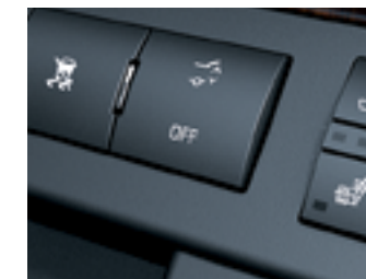
Available power-remote liftgate.