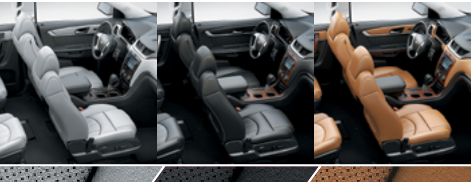
Dark Titanium-Colour/Light Titanium-Colour Perforated Leather Appointments⁵