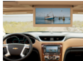
Available Rear-Seat Entertainment System.

1 MyLink functionality varies by model. Full functionality requires compatible Bluetooth and smartphone, and USB connectivity for some devices. MyLink on Traverse does not include Gracenote functionality. Visit MyLink.Chevrolet.ca for more details. 2 Data plan rates apply. 3 Visit onstar.ca for coverage map, details and system limitations. Services vary by model and conditions. After the complimentary trial period, an active OnStar service plan is required. 4 Available in 10 Canadian provinces and the 48 contiguous United States. Subscription sold separately after trial period. Visit siriusxm.ca for details. 5 Available on select Apple, Android and BlackBerry devices. Services vary by device, vehicle and conditions. Requires active OnStar service plan. 6 Requires iPhone or Android platform. 7 Standard on 1LT, 2LT and LTZ. 8 Not compatible with all devices. 9 XM Tune Select feature only available with Navigation Radio with the XM data receiver. Must be tuned to XM for the alerts to be displayed.