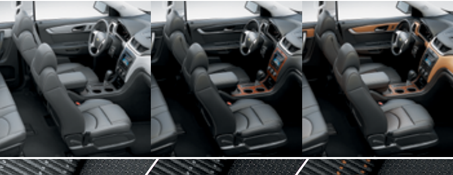
Dark Titanium-Colour/Light Titanium-Colour Premium Cloth¹²