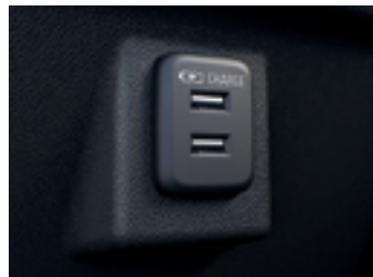
Two rear USB ports for charging only.

STAY CONNECTED With available Chevrolet MyLink, 1 you can handle calls, play music and access contacts from your compatible smartphone simply by touching the 165 mm (6.5-in.) diagonal colour touch-screen or by saying a command. Bluetooth ® wireless technology lets you make, answer and end phone calls without ever taking your hands off the wheel. You can also stream music from an online source like Stitcher SmartRadio. 2