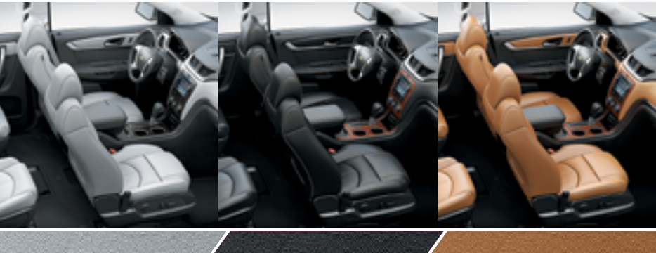
Dark Titanium-Colour/Light Titanium-Colour Leather Appointments³