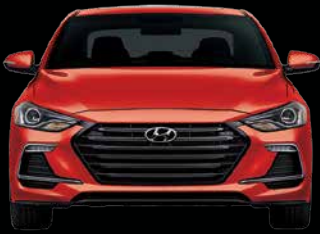
Overall width (excluding mirrors)