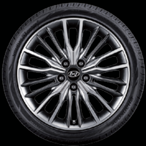
Standard 18" alloy wheels

Choice of interior colour depends upon model and/or exterior colour selection. Colours shown are for reference only and may vary from the actual hue and appearance. Visit hyundaicanada.com or see your dealer for details.