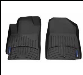
All-Weather Floor Liners

Protect the interior of your Hyundai with the most advanced floor protection available. These front floor liners feature raised edges to protect your carpet from dirt, rain, slush and snow. Designed to snap in using the factory carpet retention pins, these floor liners will protect your carpeting for years to come. Remove carpet mats prior to installation.