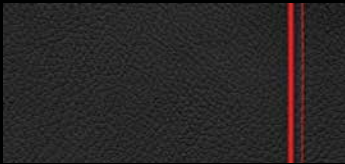
Black leather with red stitching