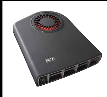
Hyundai WarmUp System

Protect the interior of your Hyundai with the most advanced floor protection available. These front floor liners feature raised edges to protect your carpet from dirt, rain, slush and snow. Designed to snap in using the factory carpet retention pins, these floor liners will protect your carpeting for years to come. Remove carpet mats prior to installation.