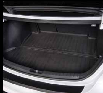
Premium All-Weather Cargo Tray

Keep the inside of your car warm in winter months without using a drop of fuel! The Hyundai WarmUp System includes an interior cabin heater and a fully programmable display unit as well as an integrated battery charger.