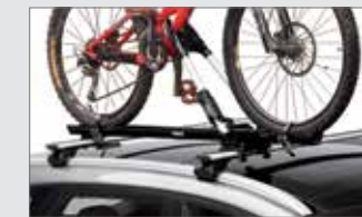
Roof-mounted bike rack