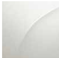
Snow White Pearl* BC/BL/BPL/BNL/WNL