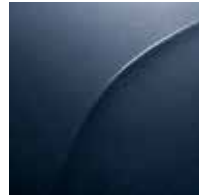
Blaze Blue* BC/BL