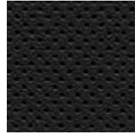
Black Premium Leather (BPL)