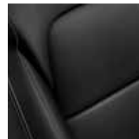
Black leather (BL)