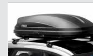
Roof cargo box