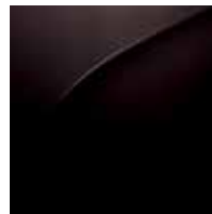
Black Cherry* BC/PC/BL/BRL/CBL