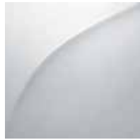
Polar White BC/PC/BL/BRL/CBL