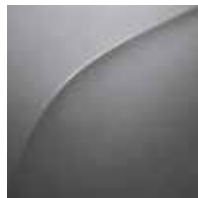
Mineral Silver* BC/PC/BL