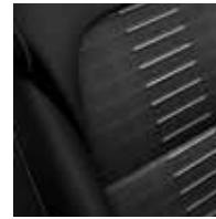
Premium cloth (PC)