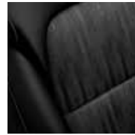
Black cloth (BC)