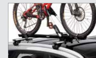
Roof-mounted bike rack