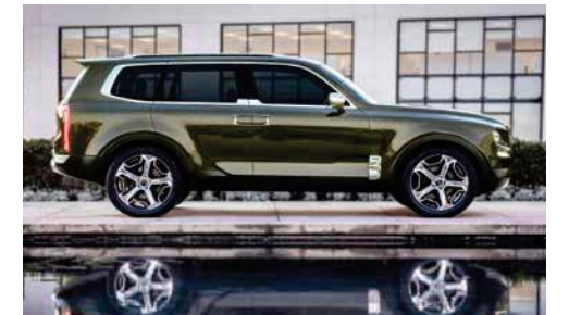
Telluride SUV concept