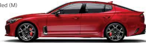
California Red (M)