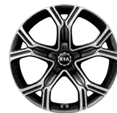
19" machined-finish alloy wheel