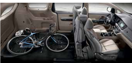
International model shown