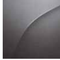
Graphite (M) GC/GL/BBL