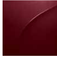
Merlot (M) GC/GL/BBL