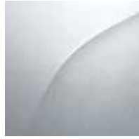
Sterling (M) GC/GL/CBL