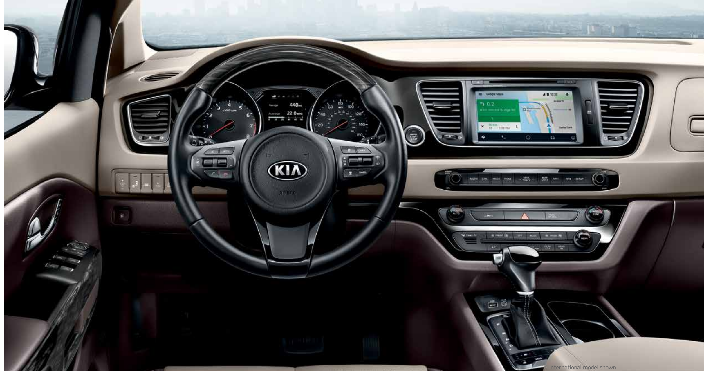
International model shown.

The 2017 Sedona comes standard with Bluetooth® wireless technology to provide hands-free calling connectivity with Bluetooth-enabled cell phones.