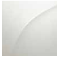
Snow White Pearl (P) GC/GL/BBL