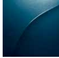
Midnight Sapphire (M) GC/GL/CBL