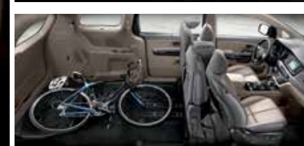
International model shown