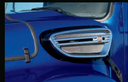
Engine air intake with snow door.