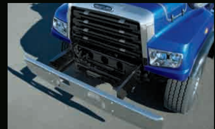
Tilt hood with radiator-mounted stationary grille and front frame extensions.