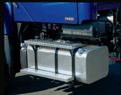
Under cab storage for up to three batteries allows for clear back of cab packaging.