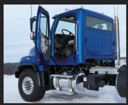
Ease of entry/exit and clear back of cab packaging.