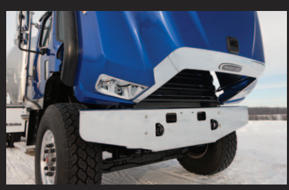
Tilt hood with radiator-mounted stationary grille and bridge formula front bumper.