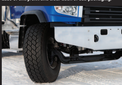
Up to 45 degree wheel cut depending on wheel equipment.