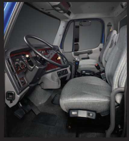
Ergonomically designed driver's area features an automotive style dash, easy-to-read LED-backlit gauges and controls within easy reach.