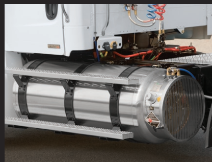
Stainless steel LNG fuel tanks are designed to keep fuel in its liquid state and offer an approximate range of 440 miles depending on your application.