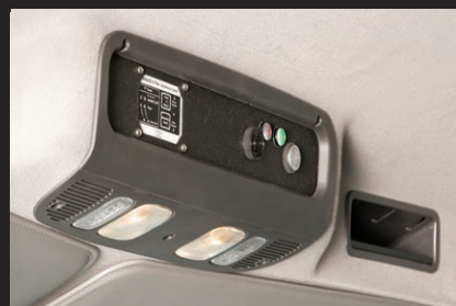
Standard methane gas detection system alerts the driver in the event of a fuel leak.