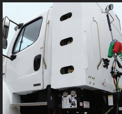
Housed in an enclosure behind the cab, carbon fiber reinforced aluminum type 3 compressed natural gas (CNG) fuel tanks offer an approximate range of 400 miles depending on your application.