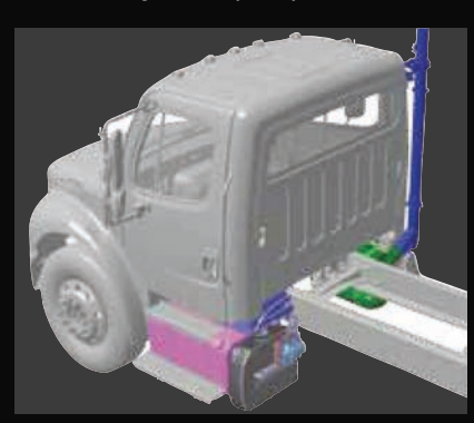
EPA 10 exhaust packaging provides the clear back of cab beverage body builders require, including alternate DEF pump locations.