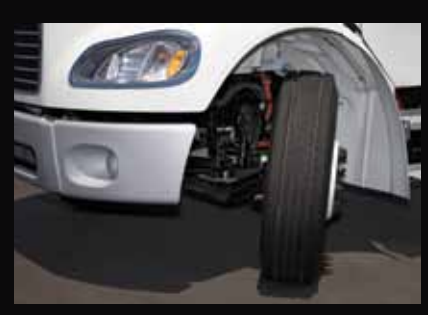
Industry-leading 55-degree wheel cut provides outstanding maneuverability to get you out of tight spaces easily.