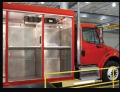
Drop-frame compatible chassis with partial inner-frame reinforcement simplifies body installation.

Visit your local Freightliner dealer for complete specifications and options.