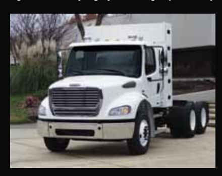
Consider going green with the M2 106 hybrid or the M2 112 natural gas tractor (shown).