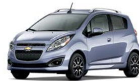
G6B - GRAPE ICE