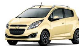
GUD - LEMONADE