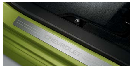
Door Sill Plates