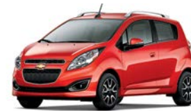
G6E - SALSA