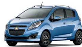
GUC - DENIM