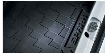
All-Weather Cargo Mat

PERSONALIZE YOUR SPARK AT GMACCESSORIES.CA