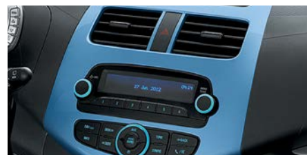
Blue Interior Trim Kit (Also available in Silver and White)