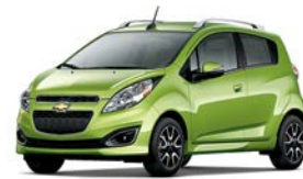
G6F - LIME