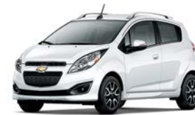
GAZ - SUMMIT WHITE