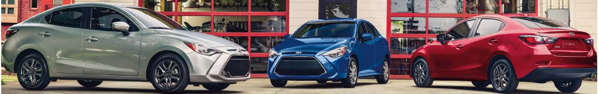
Left to right: XLE shown in Chromium, L shown in Sapphire and LE shown in Pulse.

Whether you opt for the sporty L, the well-equipped LE or the premium XLE, every Yaris offers the ideal combination of efficiency, style, tech and safety.