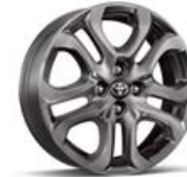
LE and XLE 16-in. dark gray split-spoke alloy wheel with P185/60R16 tires