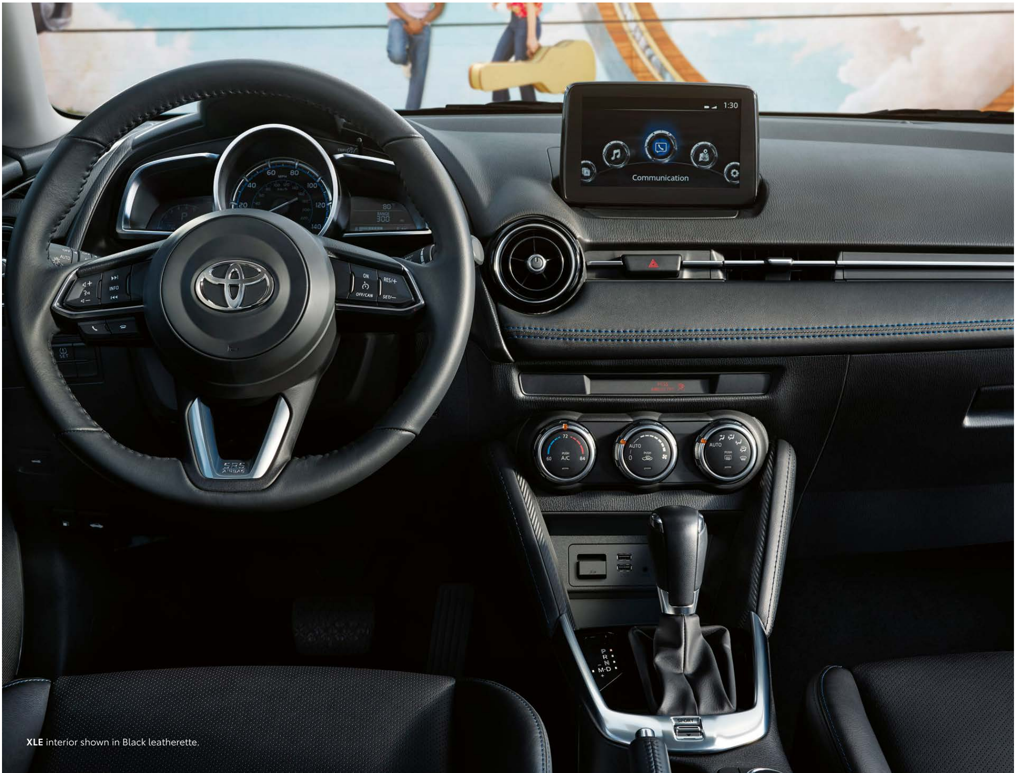
XLE interior shown in Black leatherette.