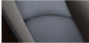
LE fabric shown in Blue Black