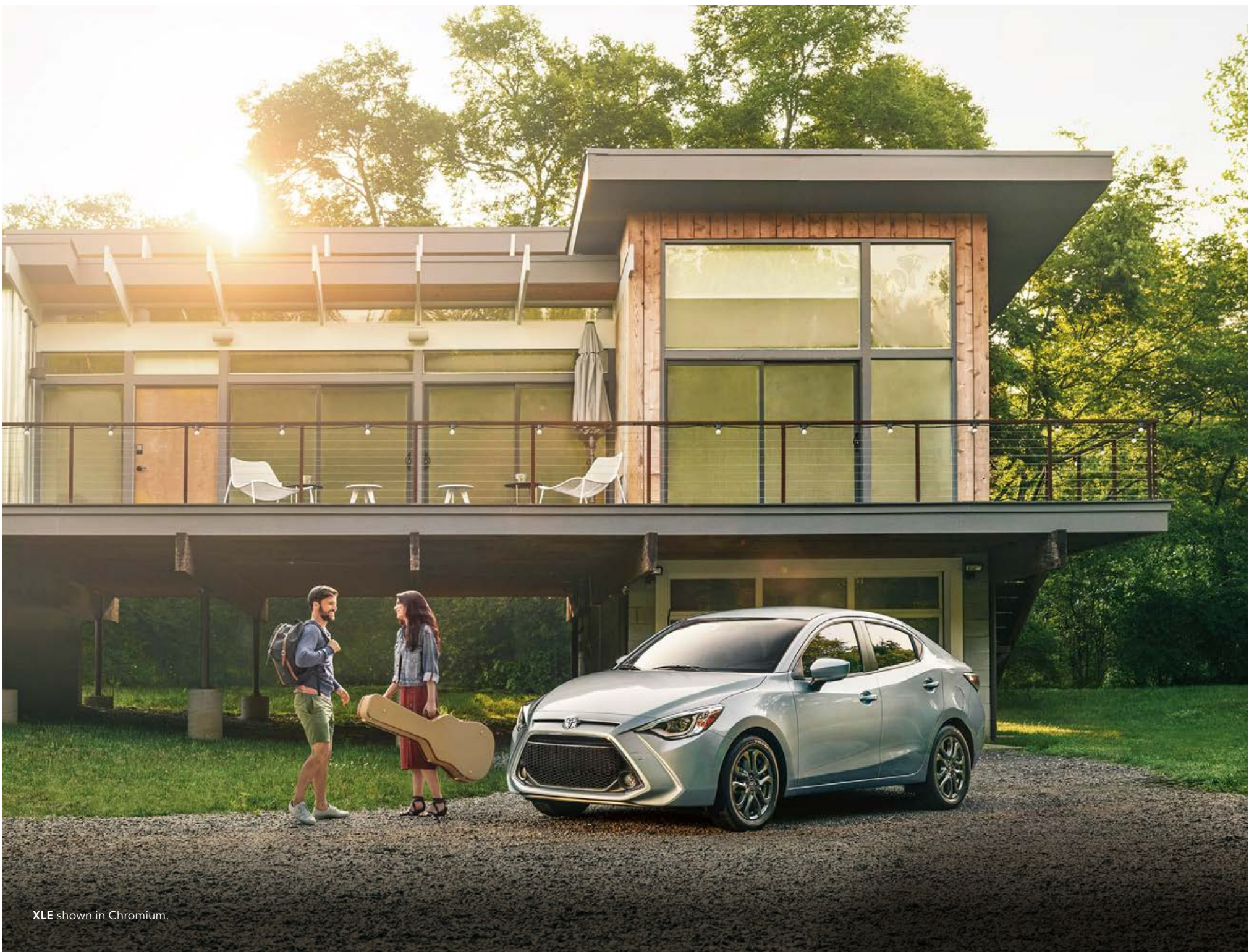
XLE shown in Chromium.