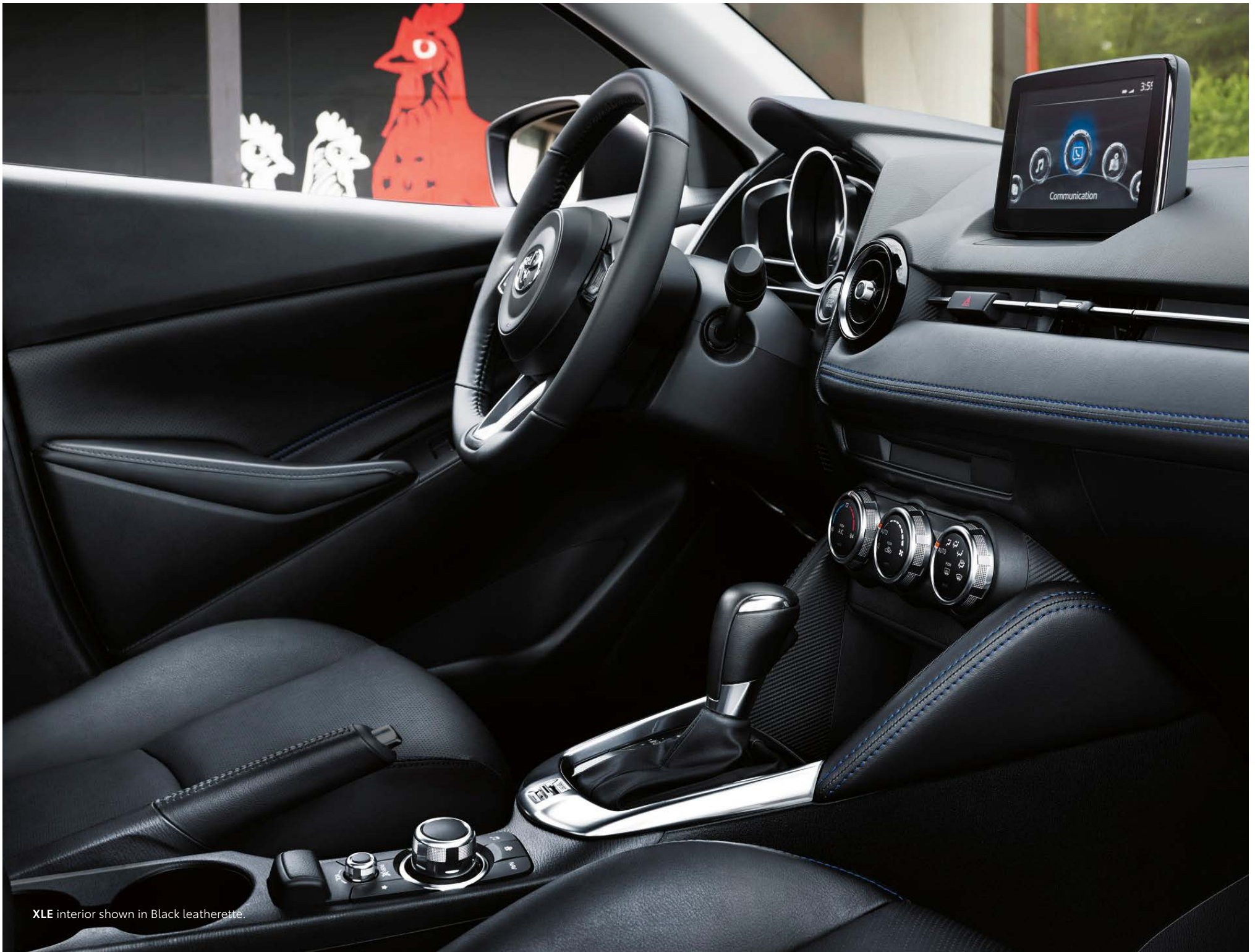
XLE interior shown in Black leatherette.