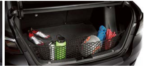
Cargo net 20