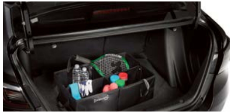
Cargo tote 20