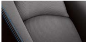
XLE leatherette shown in Black