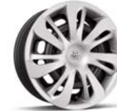
L 15-in. styled steel wheel with P185/65R15 tires