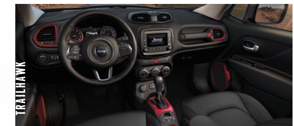
OPTIONAL ON TRAILHAWK