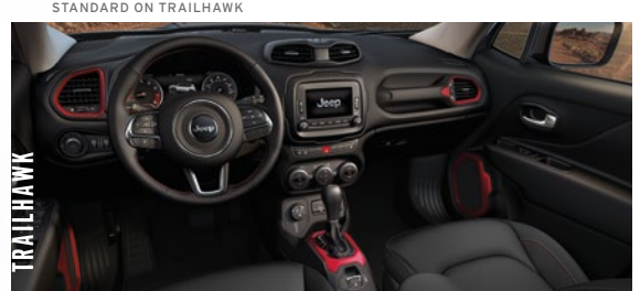
BLACK LEATHER WITH RED ACCENTS -