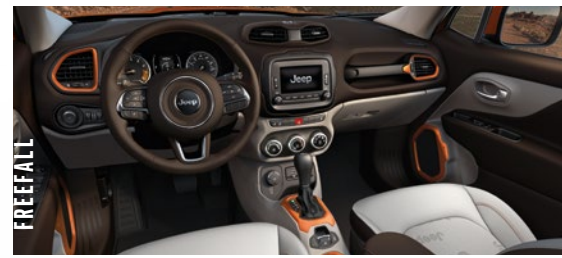
TWO-TONE BARK BROWN/SKI GREY CLOTH WITH ORANGE ACCENTS - STANDARD ON NORTH