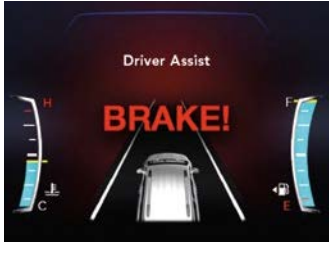
Available 7-inch in-cluster display screens