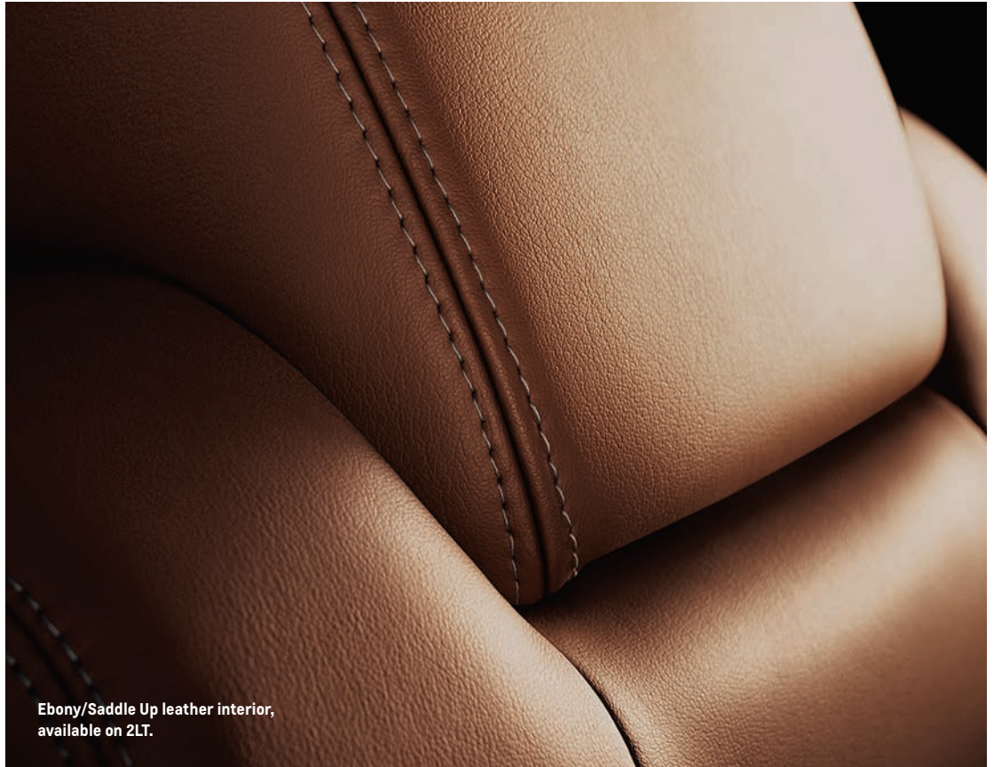
Ebony/Saddle Up leather interior, available on 2LT.