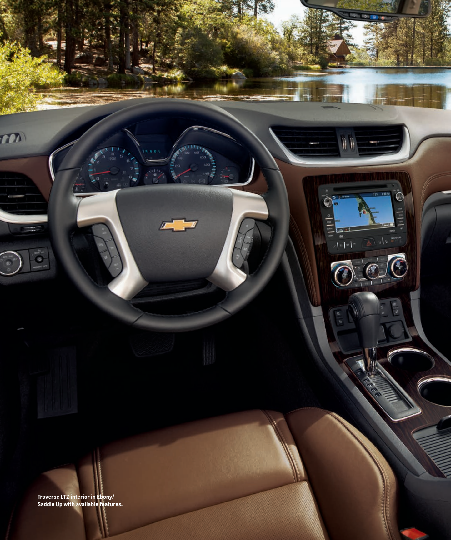
Traverse LTZ interior in Ebony/ Saddle Up with available features.

RICH REFINEMENTS. LTZ amenities include heated/cooled driver and front passenger seats, a heated steering wheel and tri-zone automatic climate controls.