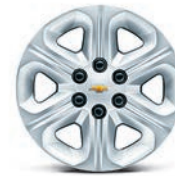
17" Steel with Painted Wheel Cover (Standard on LS Base and LS)