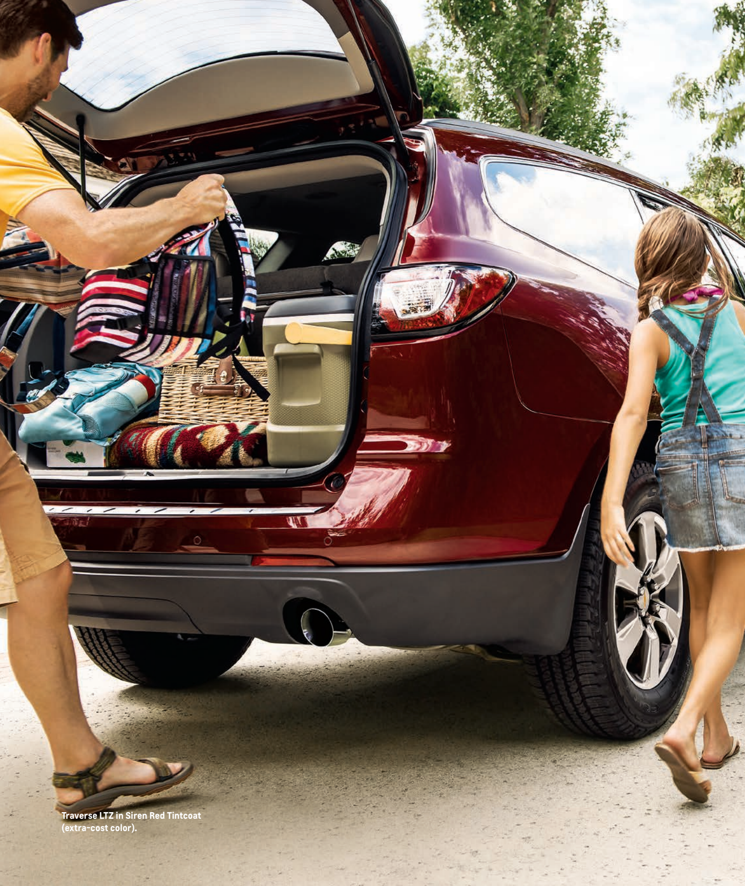
Traverse LTZ in Siren Red Tintcoat (extra-cost color).