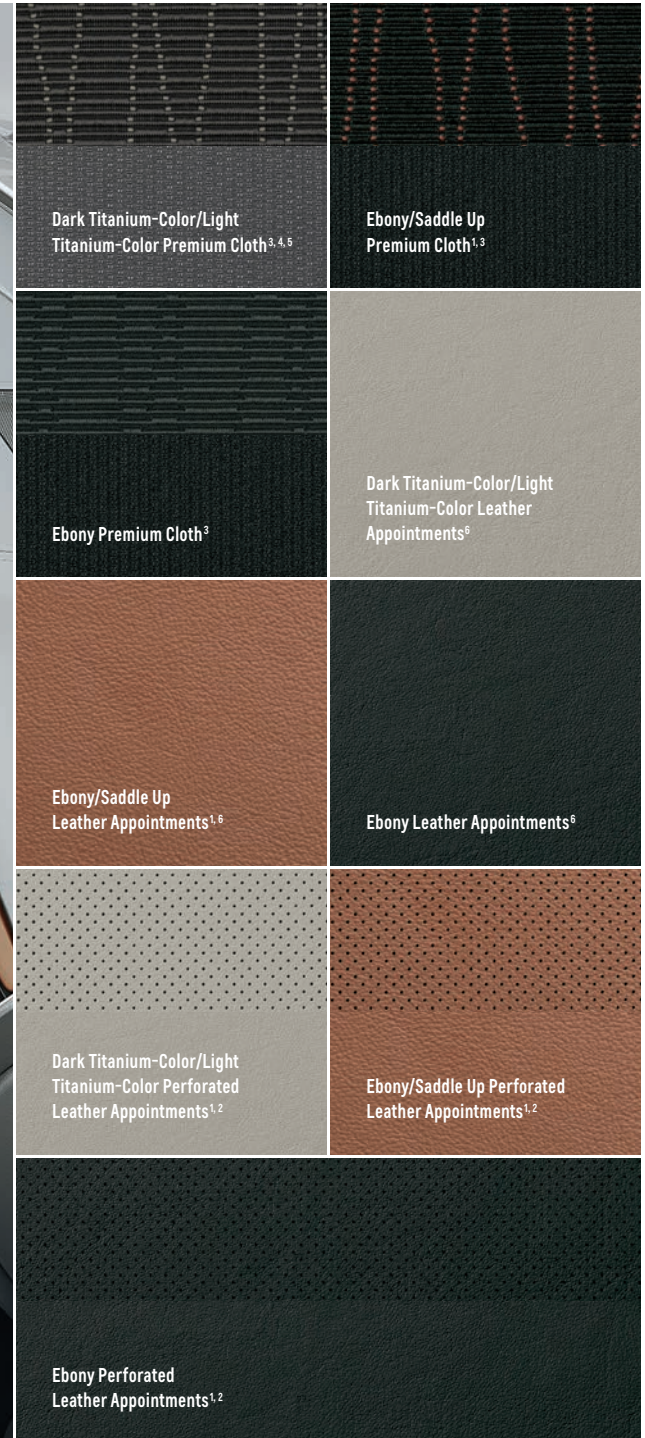
Ebony/Saddle Up Perforated Leather Appointments 1,2