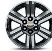
18" Machined-Aluminum (Standard on 1LT and 2LT)