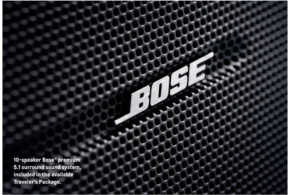
10-speaker Bose® premium 5.1 surround sound system, included in the available Traveler's Package.