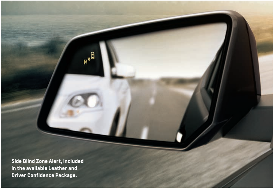
Side Blind Zone Alert, included in the available Leather and Driver Confidence Package.