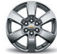
20" Painted-Aluminum (Available on 1LT; requires Style and Technology Package)