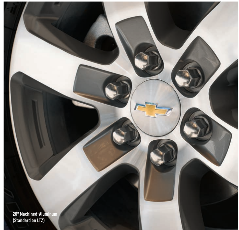
20" Machined-Aluminum (Standard on LTZ)