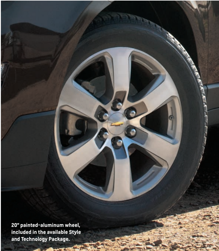
20" painted-aluminum wheel, included in the available Style and Technology Package.