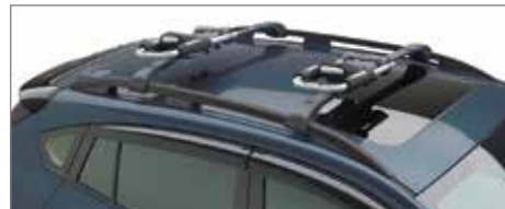
J-style carrier folds down when not in use.