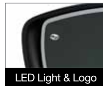
LED Light & Logo

* Requires Auto-Dimming (Interior) Mirror.