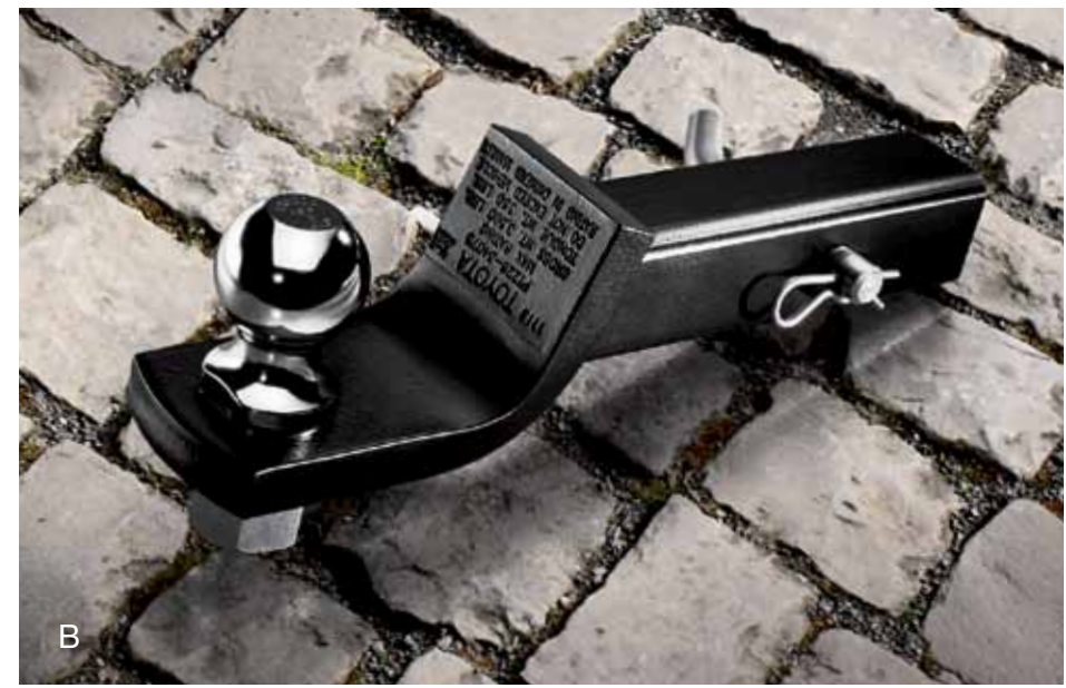
See footnote 3 in disclosure section on back cover.