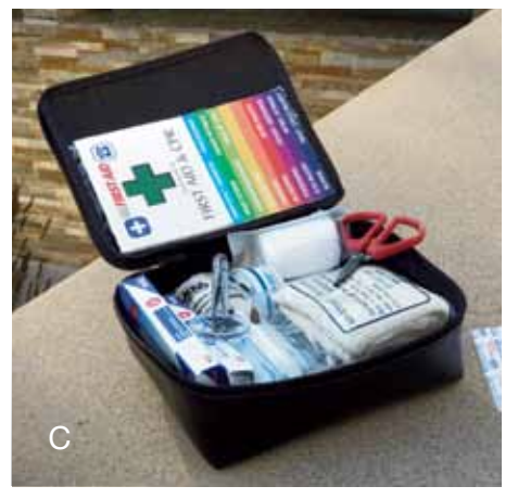
See footnote 5 in disclosure section on back cover.