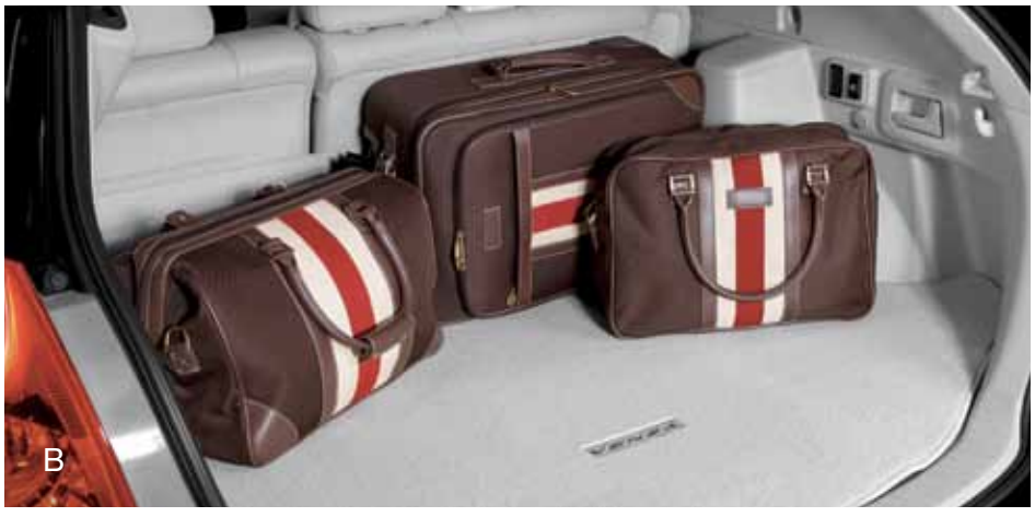
See footnote 4 in disclosure section on back cover.