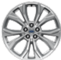
20" POLISHED ALUMINUM 3 Available

Available equipment shown, including roof-mounted kayak carrier 5 by Yakima® 1 Additional charge. 2 Metallic. 3 Restrictions may apply. See your dealer for details. 4 Certain restrictions, 3rd-party terms and data rates may apply. See footnote 1 on the “Your Tech, Your Way” pages, and your Ford Dealer for details. 5 Ford Licensed Accessory.