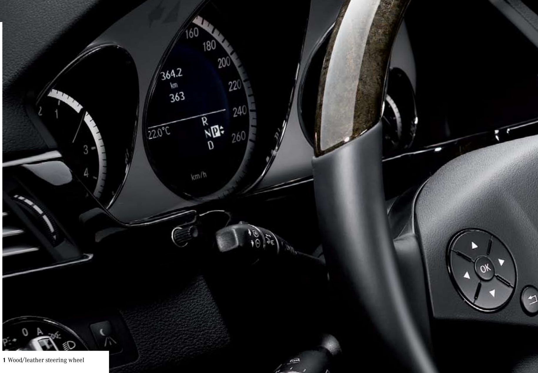
1 Wood/leather steering wheel