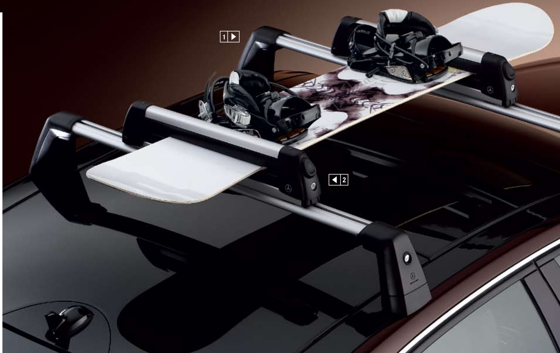
1 Alustyle basic carrier bars | p 18 | 2 Ski and snowboard rack "Standard" | p 19 |