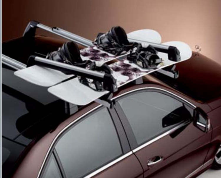
Basic carrier bars Ski and snowboard rack Transport bag

The E-Class takes you to your destination in superlative style. And if you want to change your mode of transport when you get there, no problem: whether snowboard, skis or bikes, in this section you'll find the answer to virtually any transport dilemma.