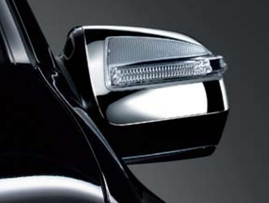
High-sheen chromed exterior mirror cover Round off your GL-Class's chrome finish and protect the paintwork from scratches.