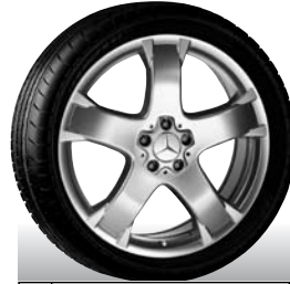
20 TYNDARIDES 5-spoke wheel 8.5 J x 20 ET 56 · 275/50 R20 B6 647 4210 Finish: sterling silver