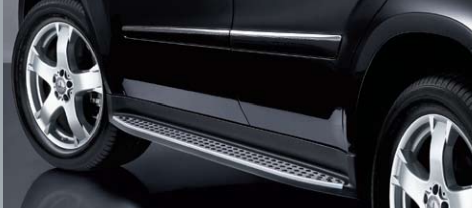
Running board with rubber studs A functional addition to your GL-Class. Aluminium-effect panel with non-slip rubber studs