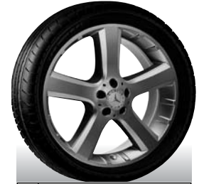
20 5-SPOKE WHEEL