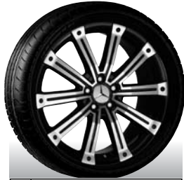
20 TOMEKO 10-spoke wheel 8.5 J x 20 ET 56 · 275/50 R20 B6 647 4528 Finish: two-tone