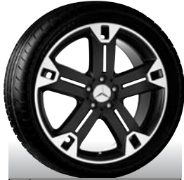
20 RECHEO 5-spoke wheel 8.5 J x 20 ET 56 · 275/50 R20 B6 647 4570 Finish: two-tone