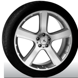
20 | 5-SPOKE WHEEL