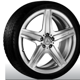
21 | AMG 5-SPOKE WHEEL

Finish: silver, high-sheen rim flange; wheel-arch flaring required