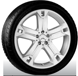
20 RECHEO 5-spoke wheel 8.5 J x 20 ET 56 · 275/50 R20 B6 647 4569 Finish: titanium silver, high-sheen