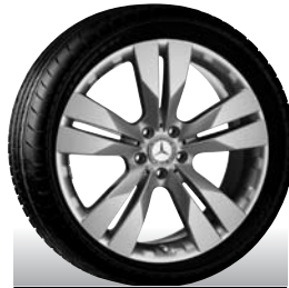
20 | 5-TWIN-SPOKE WHEEL

Finish: titanium silver or himalayas mid grey B6 647 0165