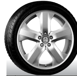
19 5-SPOKE WHEEL