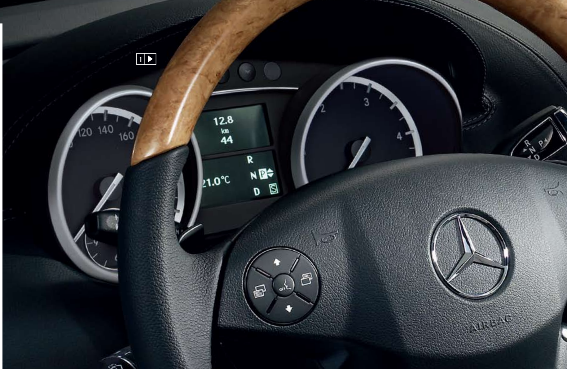
1 Wood/leather steering wheel | p 18 |