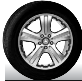
18 5-SPOKE WHEEL