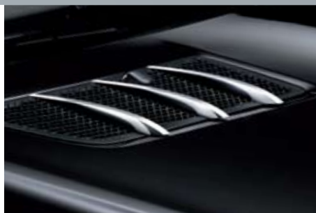
Fin attachments for hood High-sheen chromed. Available as a 6-piece set