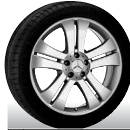
19 5-TWIN-SPOKE WHEEL