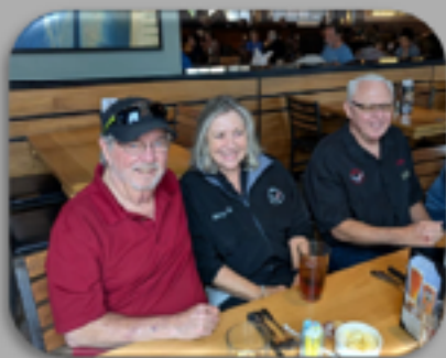
1/21/26 – Group lunch at BJ's Restaurant in Goodyear, AZ