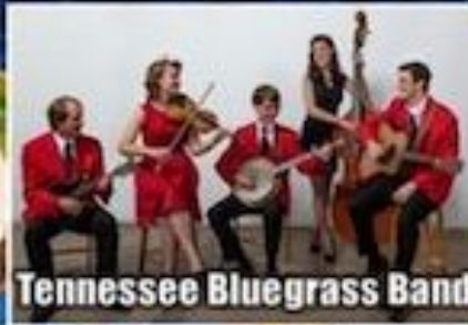
Tennessee Bluegrass Band