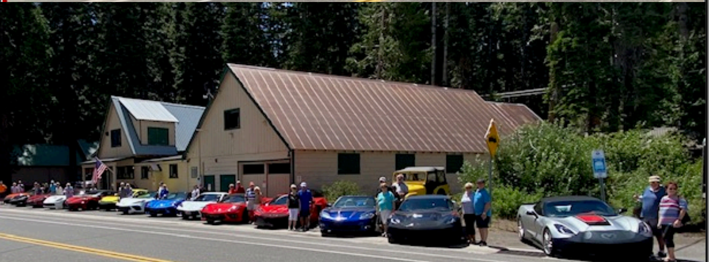
Palm Springs Corvette Club