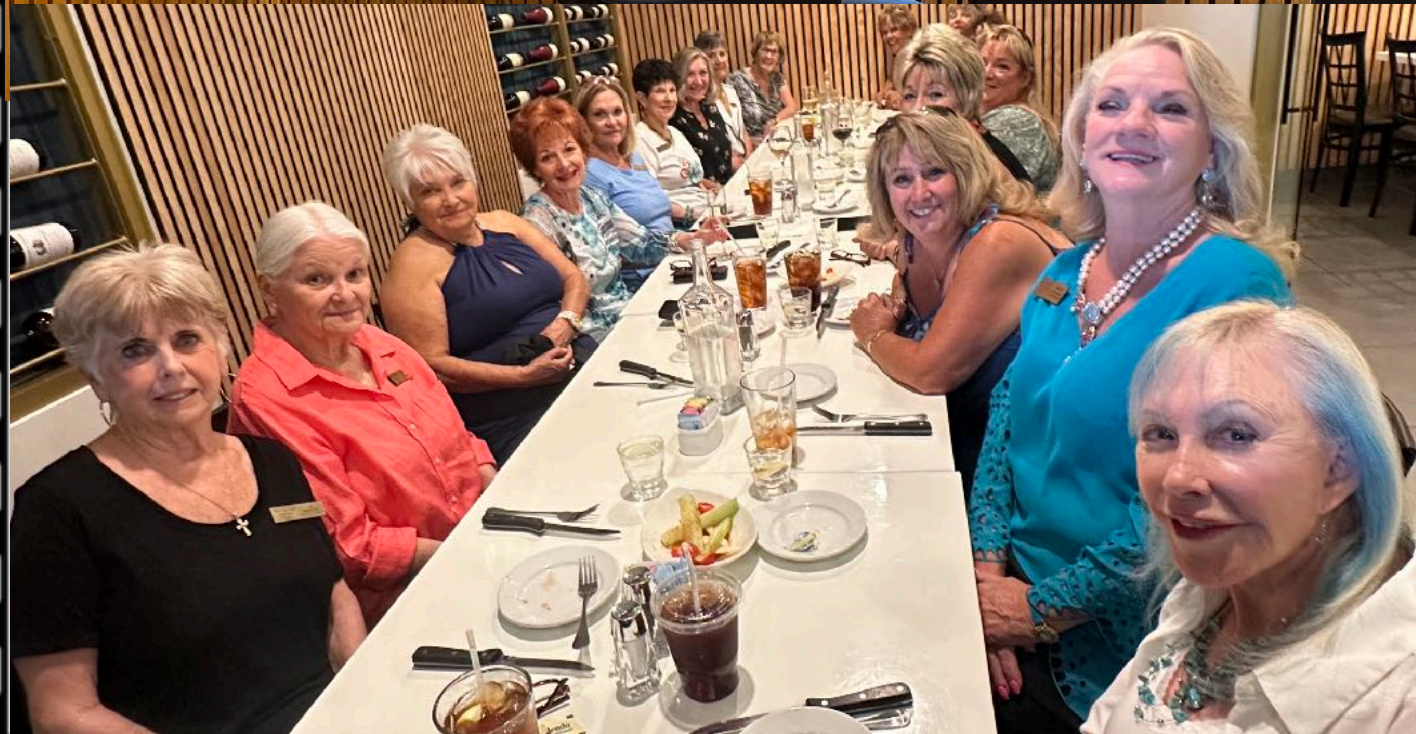
Palm Springs Corvette Club