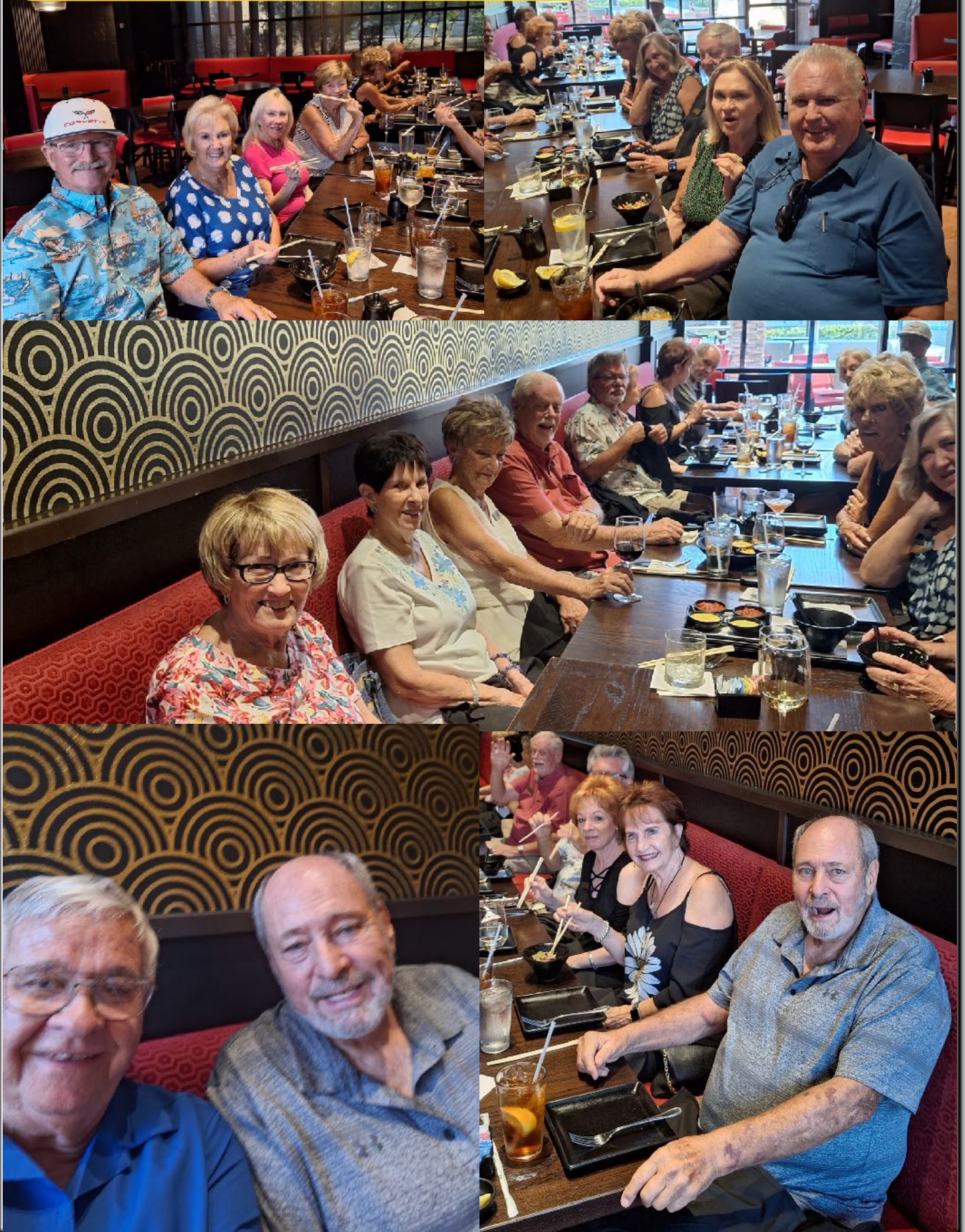
Palm Springs Corvette Club