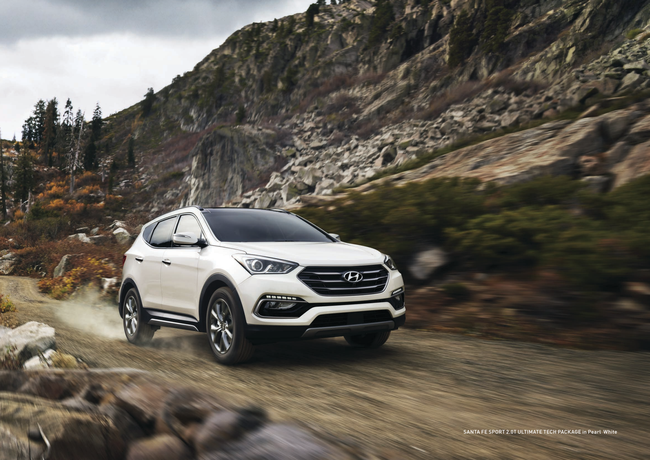
SANTA FE SPORT 2.0T ULTIMATE TECH PACKAGE in Pearl White