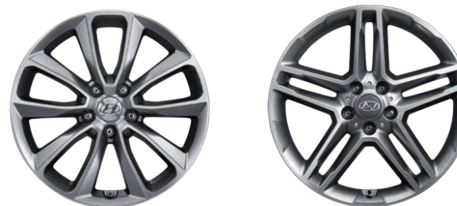
18" Alloy Wheel (Santa Fe Standard) 19" Alloy Wheel (Santa Fe Optional)