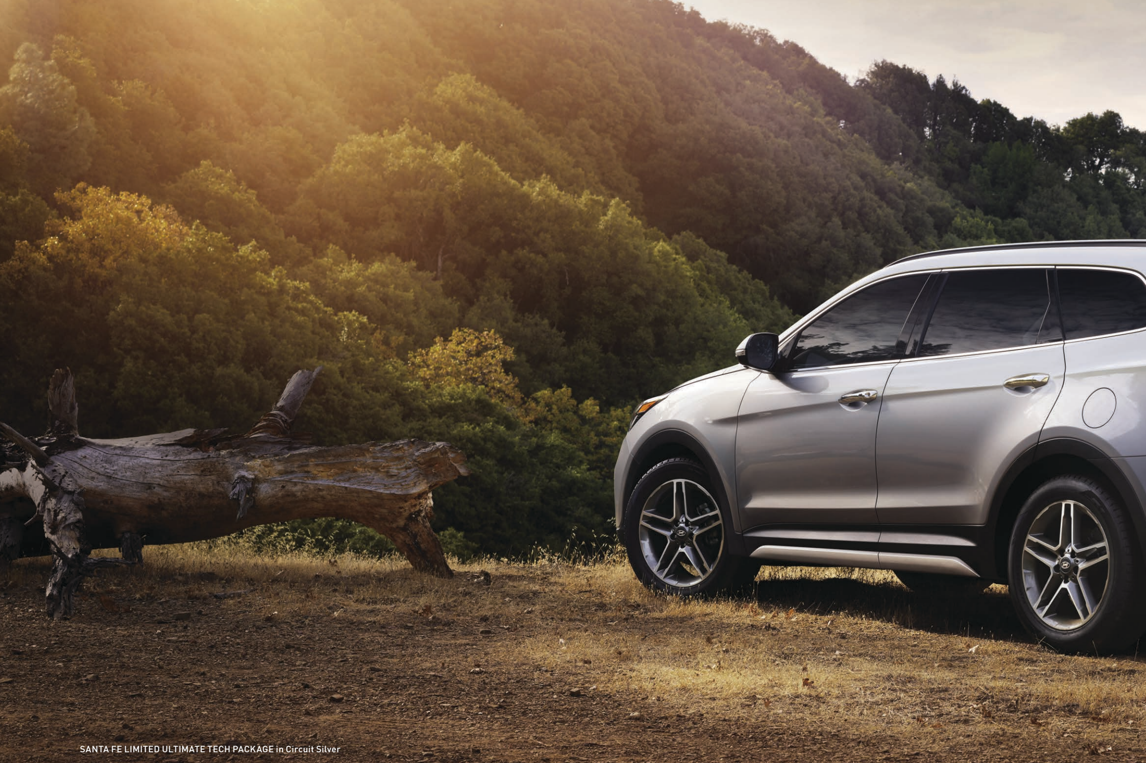
SANTA FE LIMITED ULTIMATE TECH PACKAGE in Circuit Silver