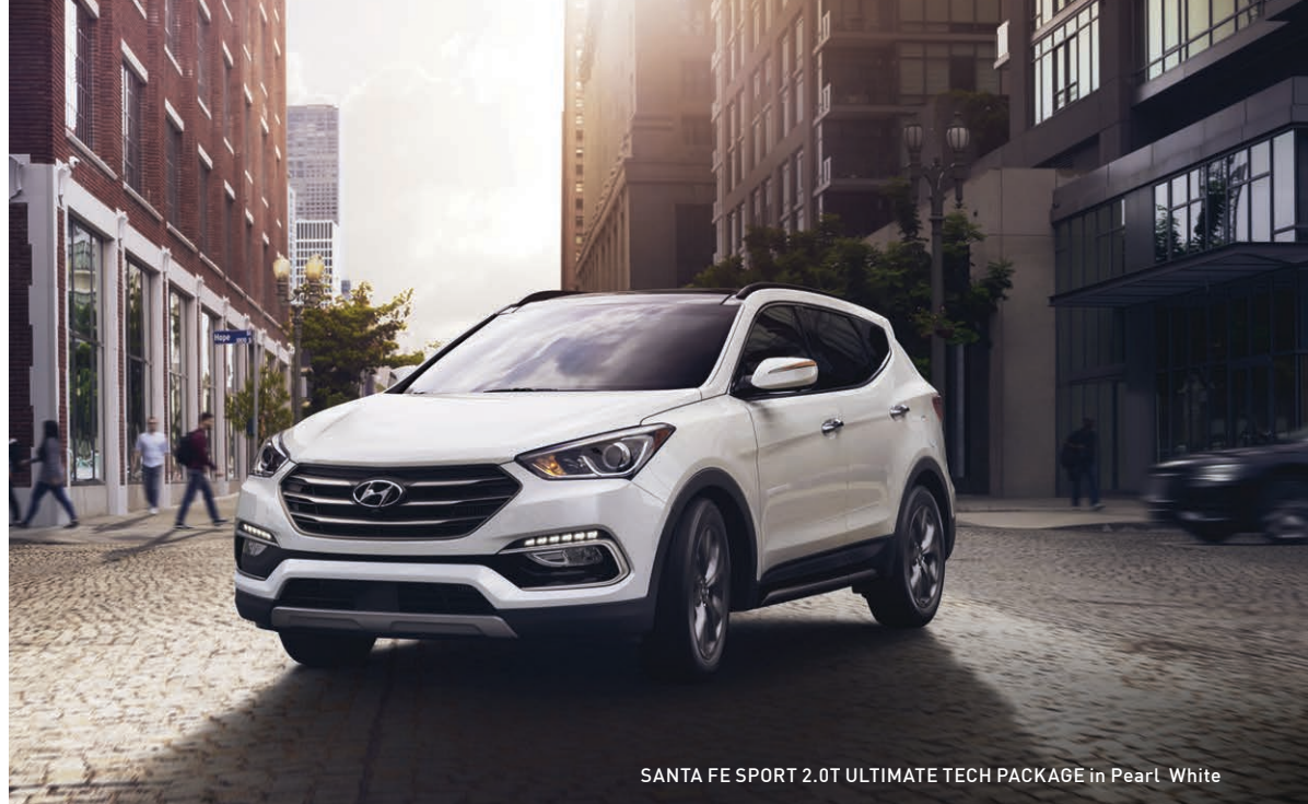
SANTA FE SPORT 2.0T ULTIMATE TECH PACKAGE in Pearl White