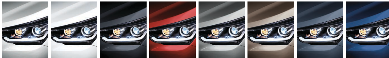
Circuit Silver Monaco White Becketts Black Regal Red Pearl Iron Frost Java Espresso Night Sky Pearl Storm Blue