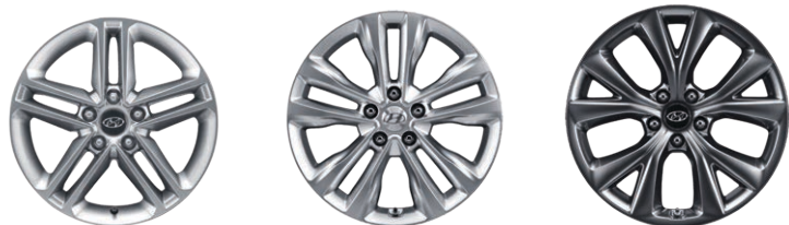
17" Alloy Wheel (2.4L Santa Fe Sport Standard) 18" Alloy Wheel (2.0T Santa Fe Sport Standard) 19" Alloy Wheel (2.0T Santa Fe Sport Optional)