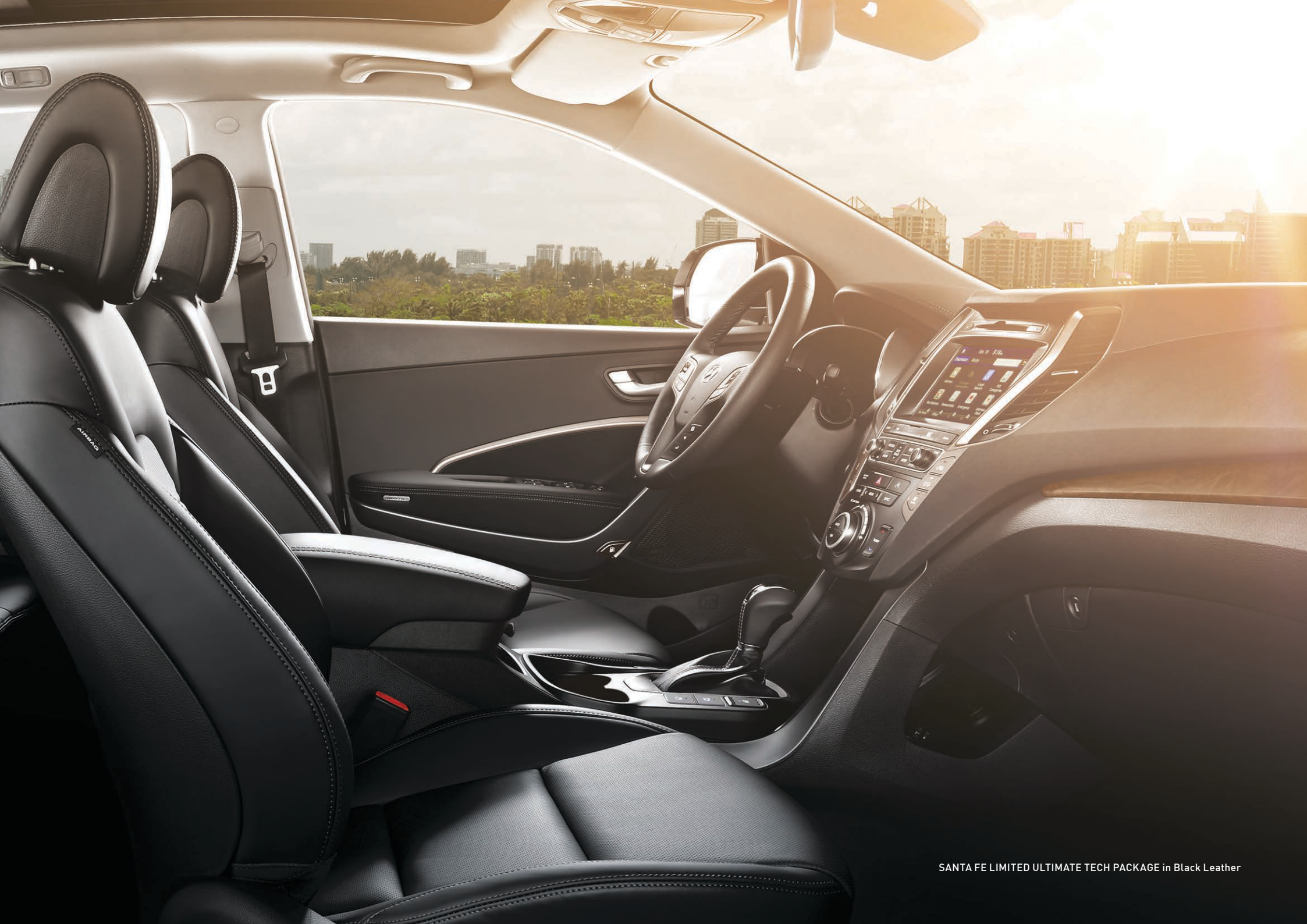
SANTA FE LIMITED ULTIMATE TECH PACKAGE in Black Leather