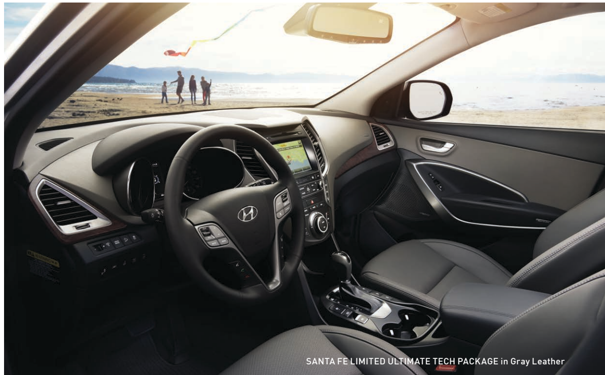
SANTA FE LIMITED ULTIMATE TECH PACKAGE in Gray Leather