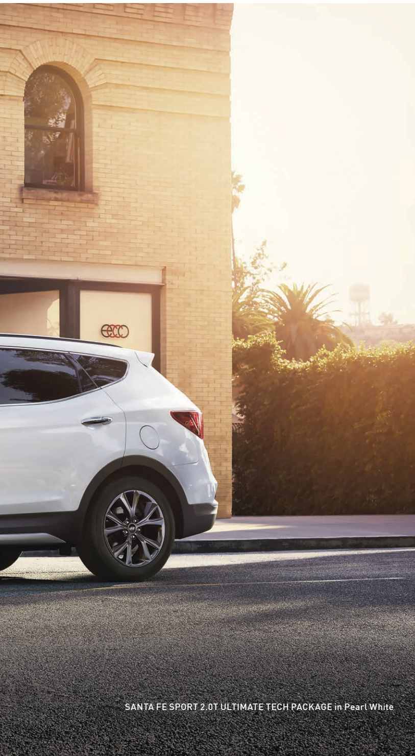
SANTA FE SPORT 2.0T ULTIMATE TECH PACKAGE in Pearl White