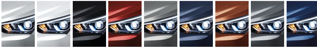
Sparkling Silver Pearl White Twilight Black Serrano Red Mineral Gray Marlin Blue Canyon Copper Platinum Graphite Nightfall Blue