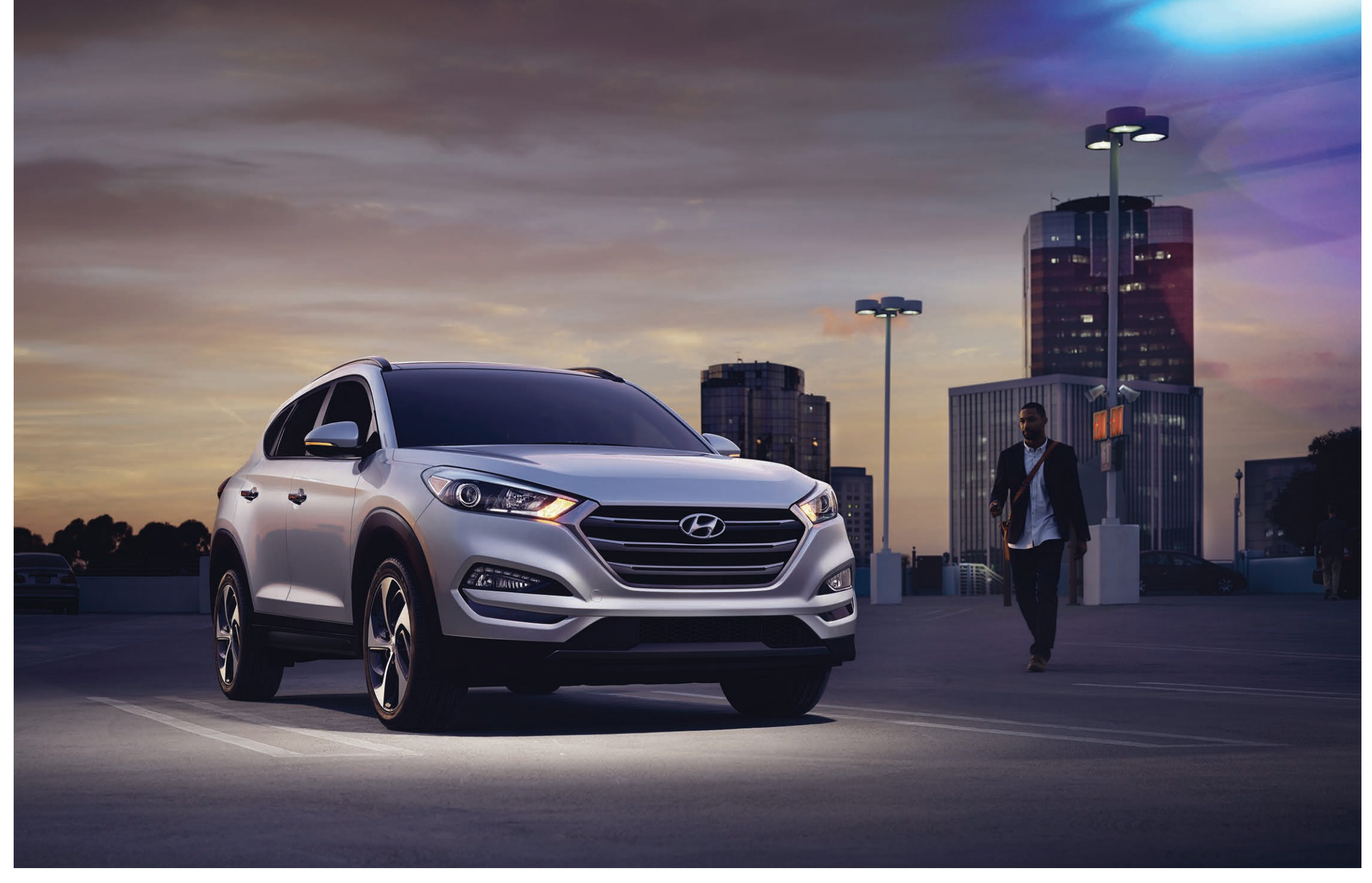
Tucson Limited with Ultimate Package in Molten Silver