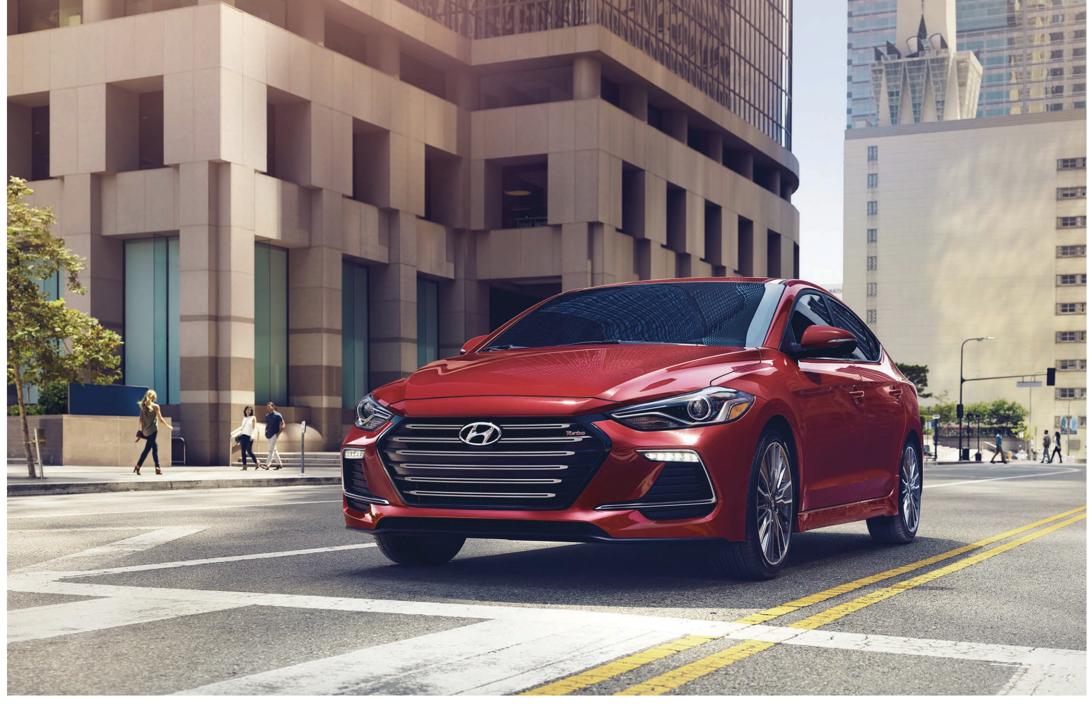
Elantra Sport with Premium Package in Scarlet Red