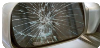
Broken or scratched windshield, windows, mirrors or lights