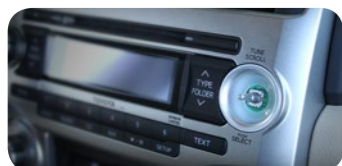
Missing parts or equipment

The purchase of an Excess Wear & Use Protection Plan is optional, cancellable (see Lease Addendum) and not required to obtain credit.