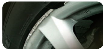
Damage to tires, rims or hubcaps