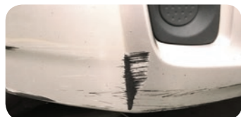
Damaged bumpers, body dents, dings or scratches