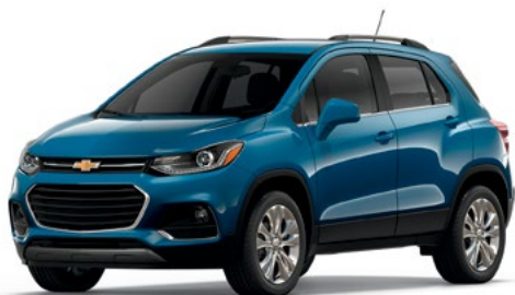
G60 – Pacific Blue Metallic 1,2