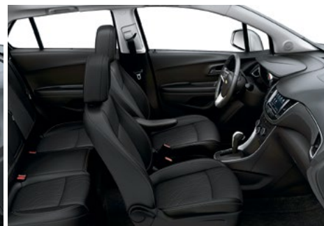
Jet Black Deluxe Cloth/Leatherette with Jet Black Accents 3