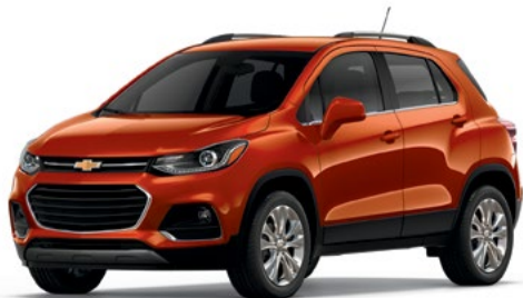
GM6 – Dark Copper Metallic 1,2