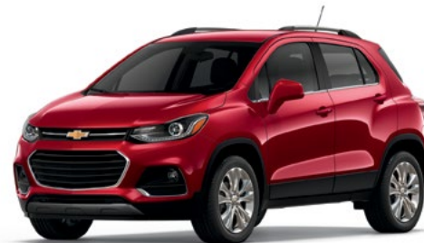
GPJ – Cajun Red Tintcoat 1,2