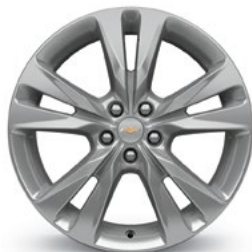
18" Midnight Silver-painted aluminum (Available on LT)