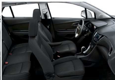
Jet Black Deluxe Cloth with Jet Black Accents 2