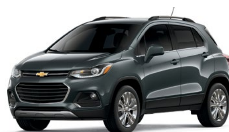
G7Q – Nightfall Grey Metallic 1