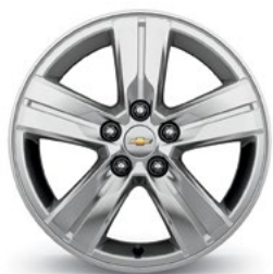
16" aluminum (Standard on LS and LT)