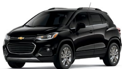
GB8 – Mosaic Black Metallic 1