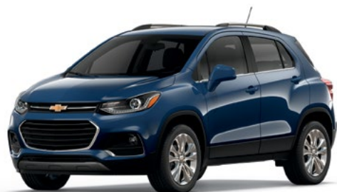
G35 – Storm Blue Metallic 1