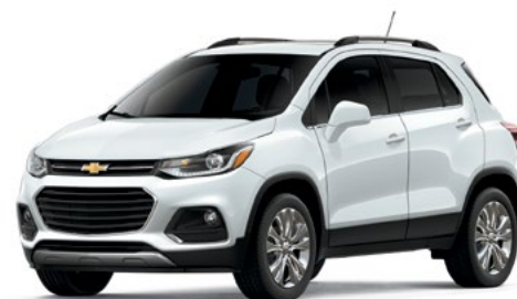
GAZ – Summit White