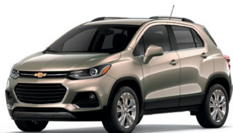
G8K – Sandy Ridge Metallic 1