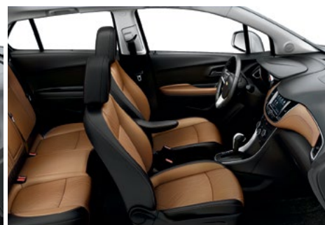
Brandy Deluxe Cloth/Leatherette with Jet Black Accents 5,6