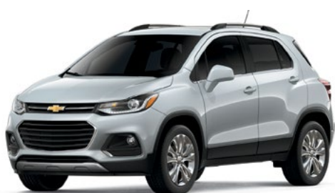
GAN – Silver Ice Metallic 3