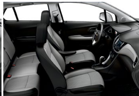
Light Ash Grey Deluxe Cloth/Leatherette with Jet Black Accents 5