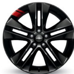
18" Black-finish aluminum with Red accent stripes (Available on LT with Redline Edition)