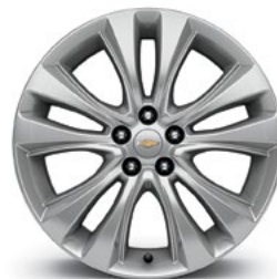
18" aluminum (Standard on Premier)