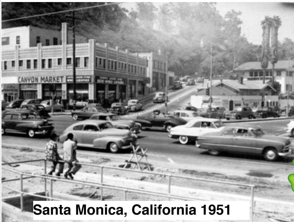
Santa Monica, California 1951