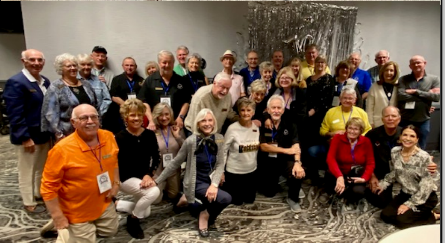
Palm Springs Corvette Club