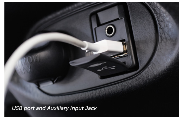
USB port and Auxiliary Input Jack