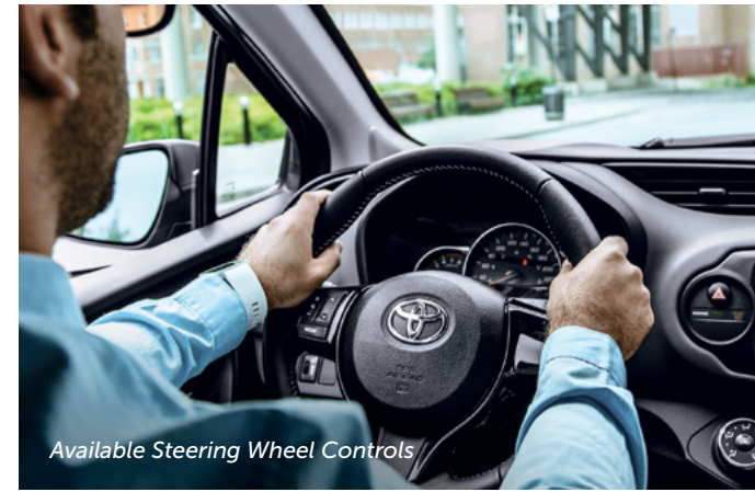
Available Steering Wheel Controls