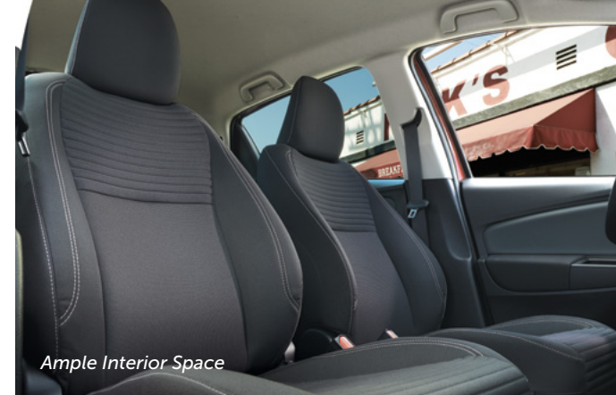
Ample Interior Space