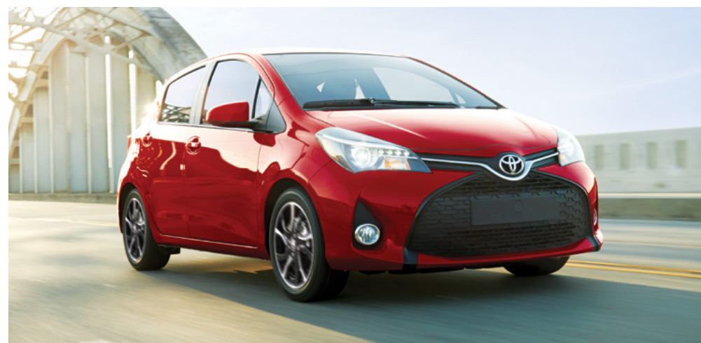
SE shown in Absolutely Red.

As if the city weren't fun enough already, you can explore more of it in a vehicle that's equally exhilarating to drive. The 2016 Yaris Hatchback offers more room in your life for spontaneity, excitement, and of course - your stuff. It features an eye-catching exterior with sleek lines, distinctive accents, a masculine stance, and a stylish interior that's compact yet spacious, with fine quality materials throughout. Inside you'll also find a host of connectivity features and intuitive technology that makes getting around, talking to friends, and listening to music easier and more enjoyable than ever. With incredible handling, a small turning circle of 9.6 m (CE,LE) and impressive fuel efficiency, we challenge you to find a better hatchback for the urban landscape. You can also take comfort knowing that the same dedication to reliability that goes into all Toyota vehicles has gone into Yaris Hatchback, proven by the fact that over 85% of Toyotas sold in Canada in the last 20 years are still on the road today. 9