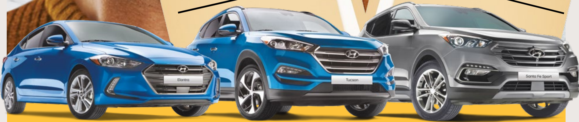
The All-New 2017 Elantra L 6MT