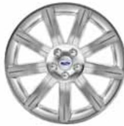
19" Polished Aluminum Standard