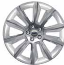
20" Bright-Painted Aluminum Optional