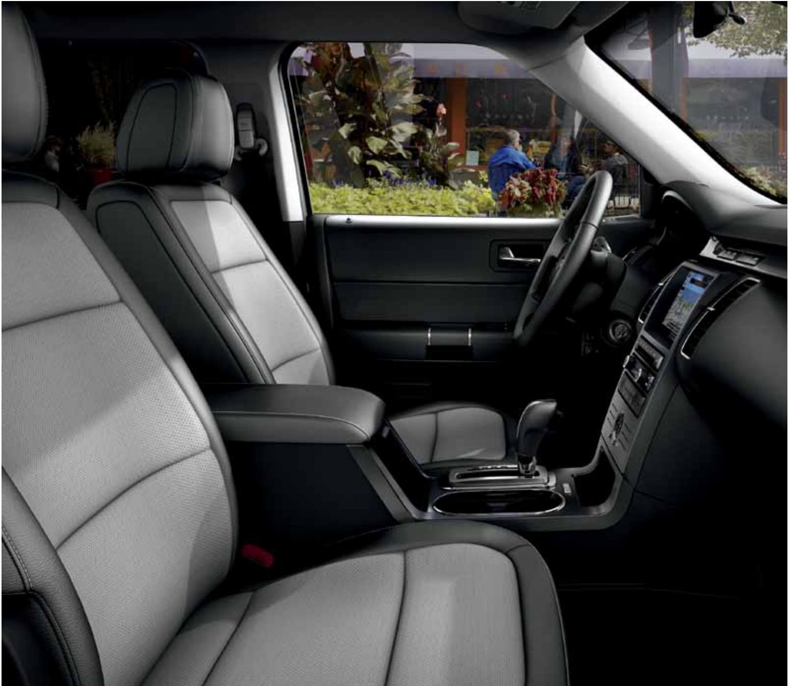
Charcoal Black leather trim with Grey Alcantara® suede perforated inserts and available equipment. | Illuminated front door-sill scuff plates. | Paddle shifters. | Black "FLEX" hood badge. | Circle Check-appearance appliques on instrument panel and door trim.