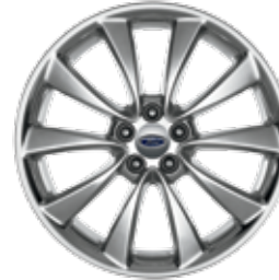
20" Polished Aluminum Standard

Charcoal Black Leather with Grey Alcantara Suede Perforated Inserts