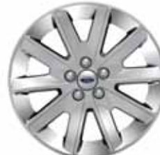
18" Machined Aluminum Standard on SEL