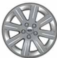
17" Painted Aluminum Standard on SE