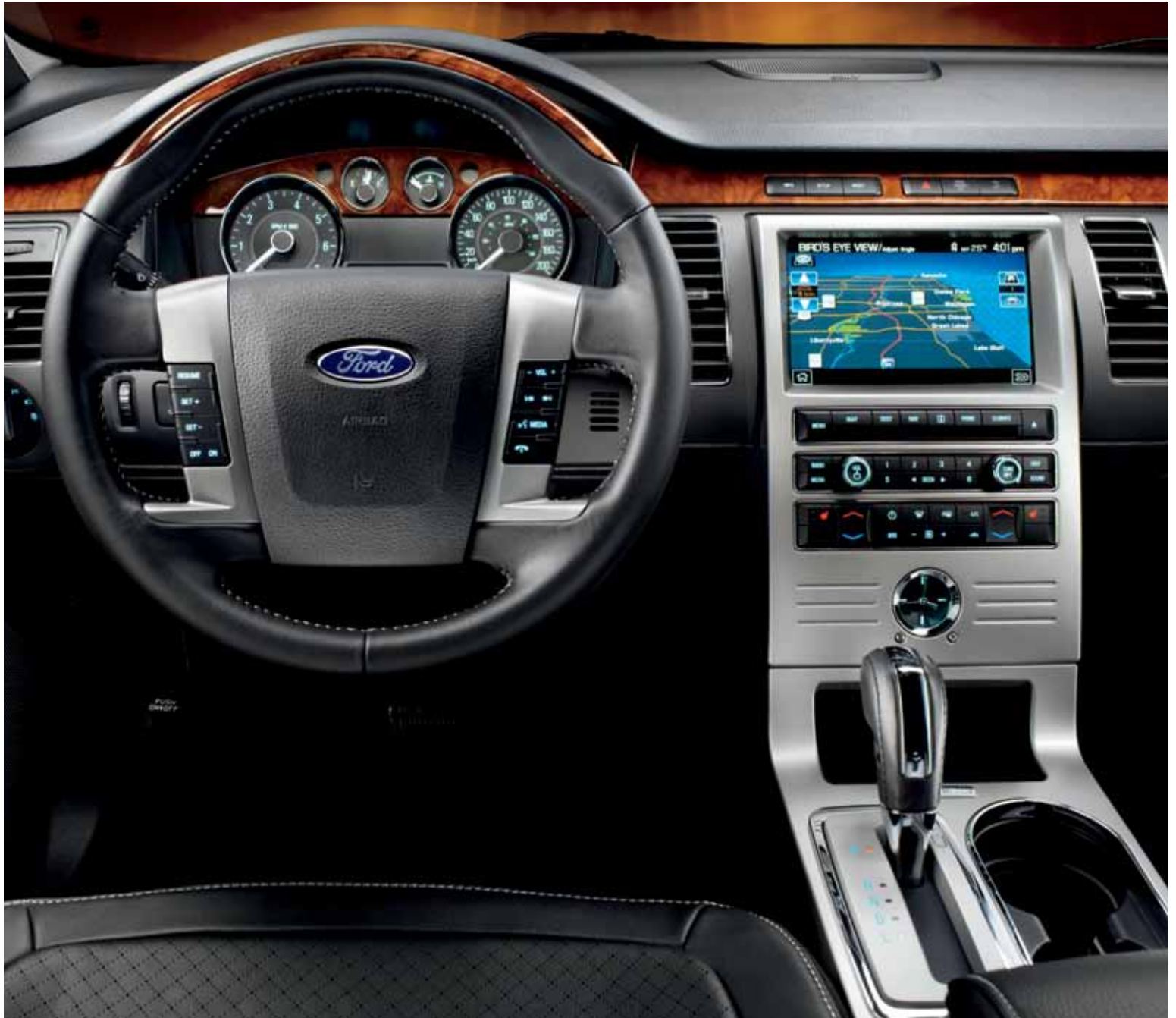
Charcoal Black leather trim with perforated inserts and available equipment. | Medium Light Stone leather trim with perforated inserts. | Power liftgate. | Refrigerated 2nd-row console! 1 | 110-volt power outlet.