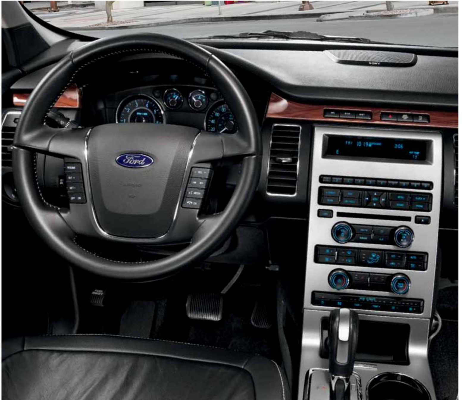
SEL. Charcoal Black leather trim with available equipment. | SE. Charcoal Black cloth with Houndstooth-patterned inserts. | SEL. Cargo net. | Ford SYNC. ®1 | SEL. Woodgrain appliqué.